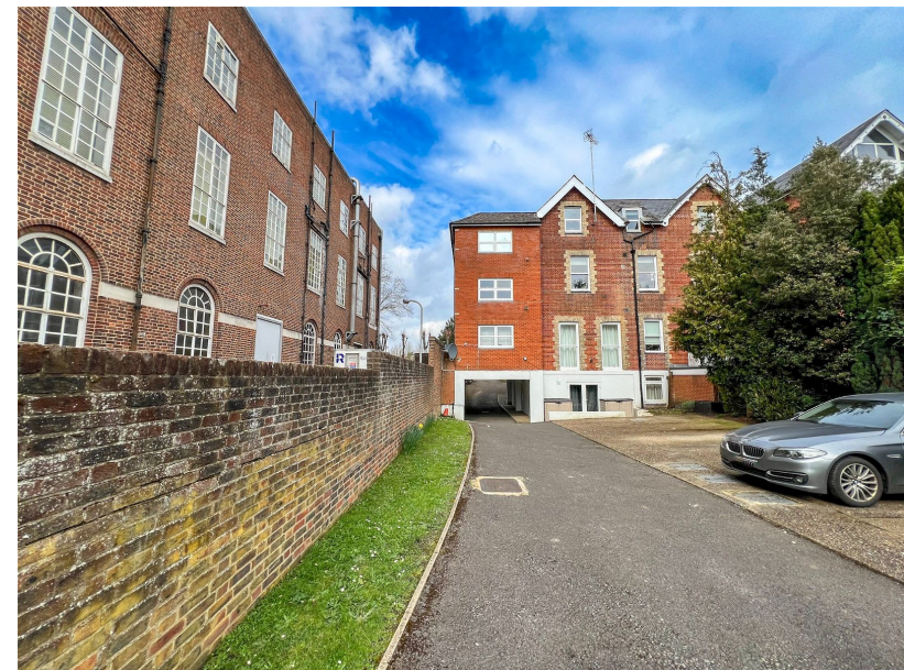
Second Floor Flat Approx. 349.0 sq. feet

A bright and well presented top floor one bedroom apartment located in the centre of Leatherhead. The apartment comprises an entrance hall, open plan kitchen/living room, good sized double bedroom, spacious bathroom and access to a large loft. At the rear of the property there is a communal garden and allocated off-street parking. The property is just moments from Leatherhead town centre, the mainline train station, and offers easy access to the A24 and M25 by car.