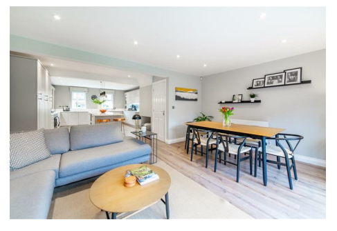
Barmoor Drive Great Park, NE3 5RG