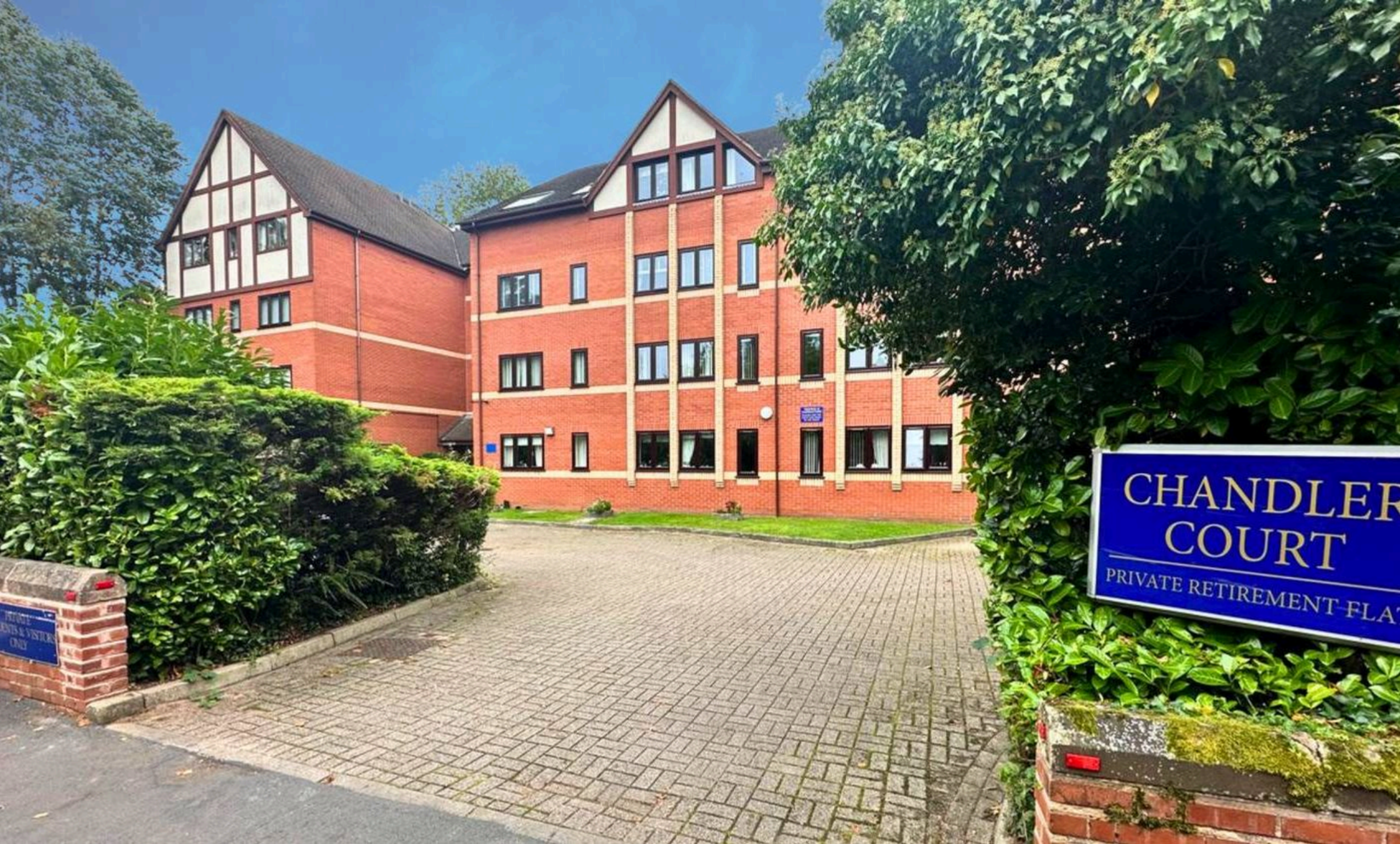
Flat 24, Chandler Court Davenport Road, Coventry £125,000