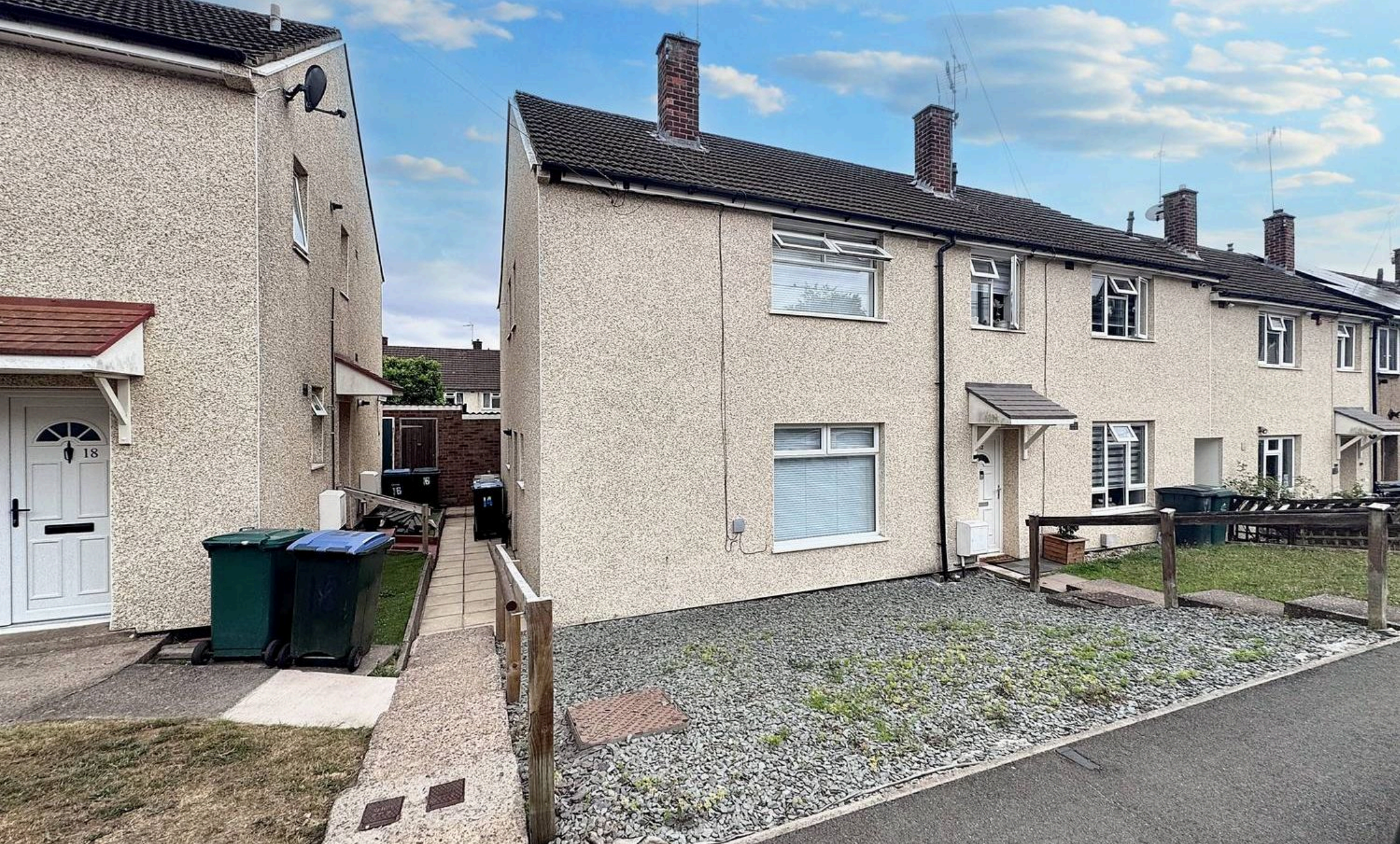
14 Empire Road, Coventry – CV4 9LR £1,200 pcm