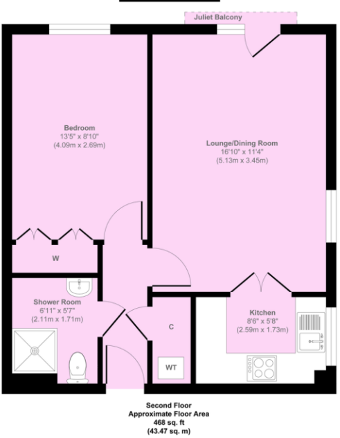
Approx. Gross Internal Floor Area 468 sq. ft / 43.47 sq. m illustration for identification purposes only, measurements are approximate, not to scale. Copyright © markbeaumont com