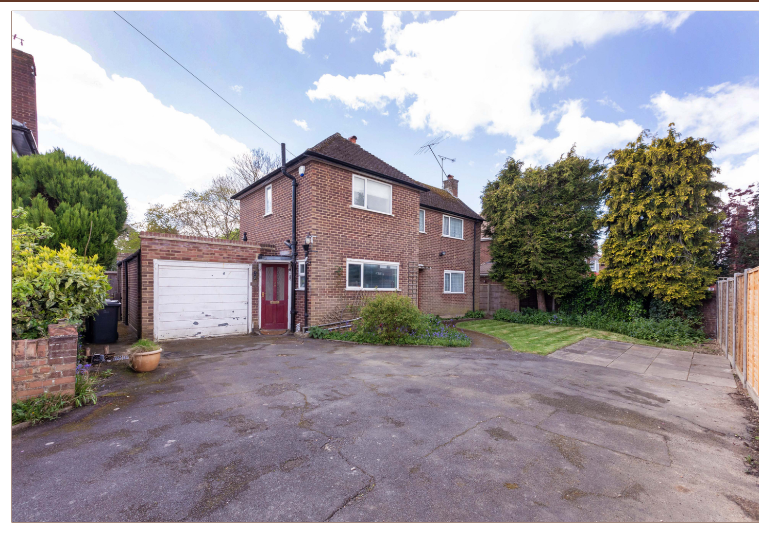
Occupying a highly desirable corner plot with a substantial private driveway leading to the property, this three bedroom detached house located within Castleview catchment, offers a fantastic investment opportunity.

Internally the house covers a total area of 1428 square feet, whilst notable space to the side and rear provide excellent scope for future development.