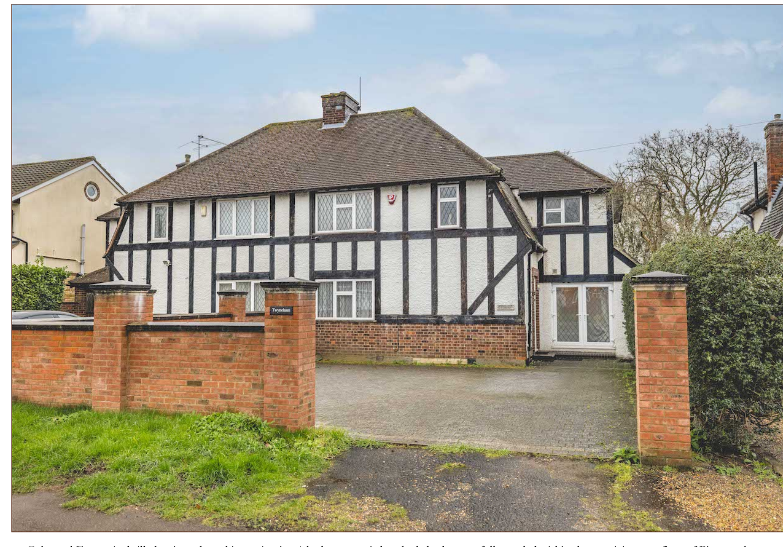
Oakwood Estates is thrilled to introduce this captivating 4-bedroom semi-detached abode, gracefully nestled within the prestigious confines of Pinewood Green. Radiating an aura of sophistication and charm, this residence embodies the epitome of refined living. With its spacious interiors, thoughtfully designed layout, and enviable location, it stands as a testament to the artistry of modern living. Ideal for discerning families yearning for a sanctuary to call their own, this property promises an unparalleled blend of comfort, convenience, and timeless allure.