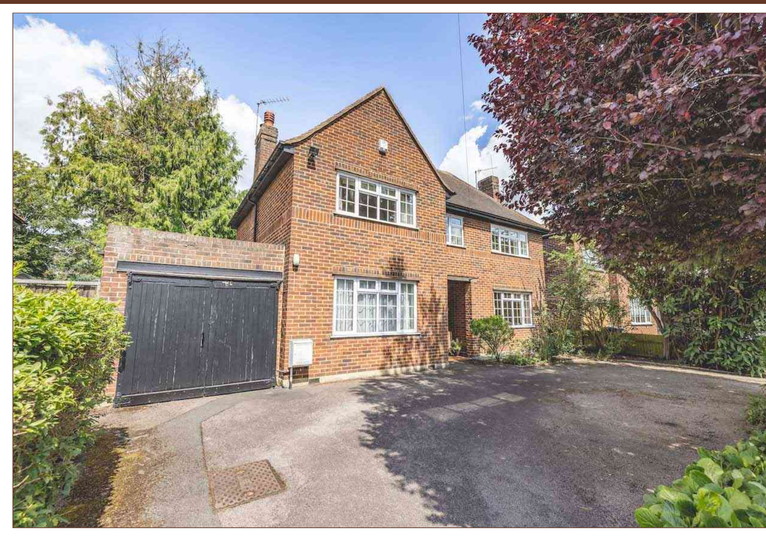
This three bedroom detached family home is situated on a sought after cul-de-sac nearby to Burnham High Street and just 0.2 miles from Burnham Grammar School. The property is offered to the market in need of modernisation and with the potential to extend onto the rear (STP).

The ground floor features two reception rooms with the inclusion of a 25ft living room and a 12ft dining room. There is also a 15ft fitted kitchen/breakfast room, a downstairs cloakroom and a sizeable entrance hall.