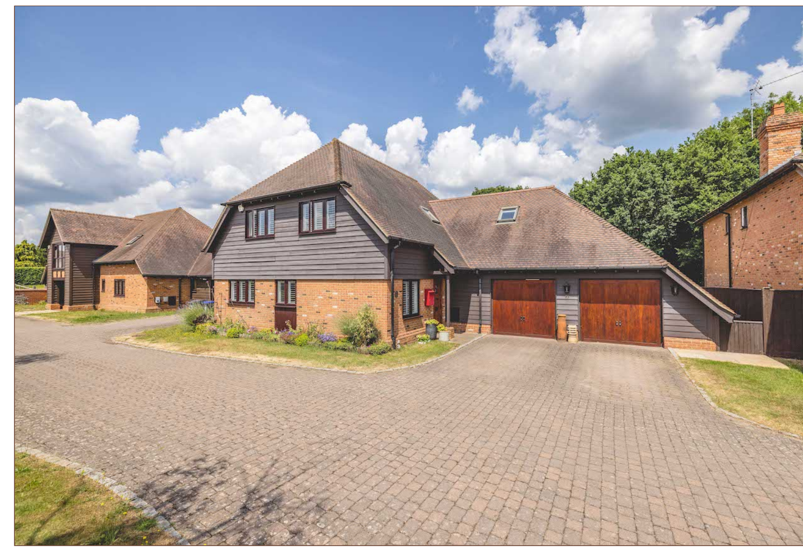
Nestled within a delightful gated development, this stunning home offers an array of remarkable features. Originally constructed by Berkeley Homes, it was designed as a four-bedroom residence but has been thoughtfully reconfigured to provide three bedrooms. the conversion can effortlessly be reversed, allowing you to tailor the layout according to your preferences.

Upon entering this property, you'll be greeted by a welcoming reception hallway, setting the tone for the luxurious living experience that awaits. The sitting room exudes elegance and warmth, providing the perfect space to relax and unwind. Bathed in natural light, an exquisite Orangery offers a seamless transition between indoor and outdoor living.