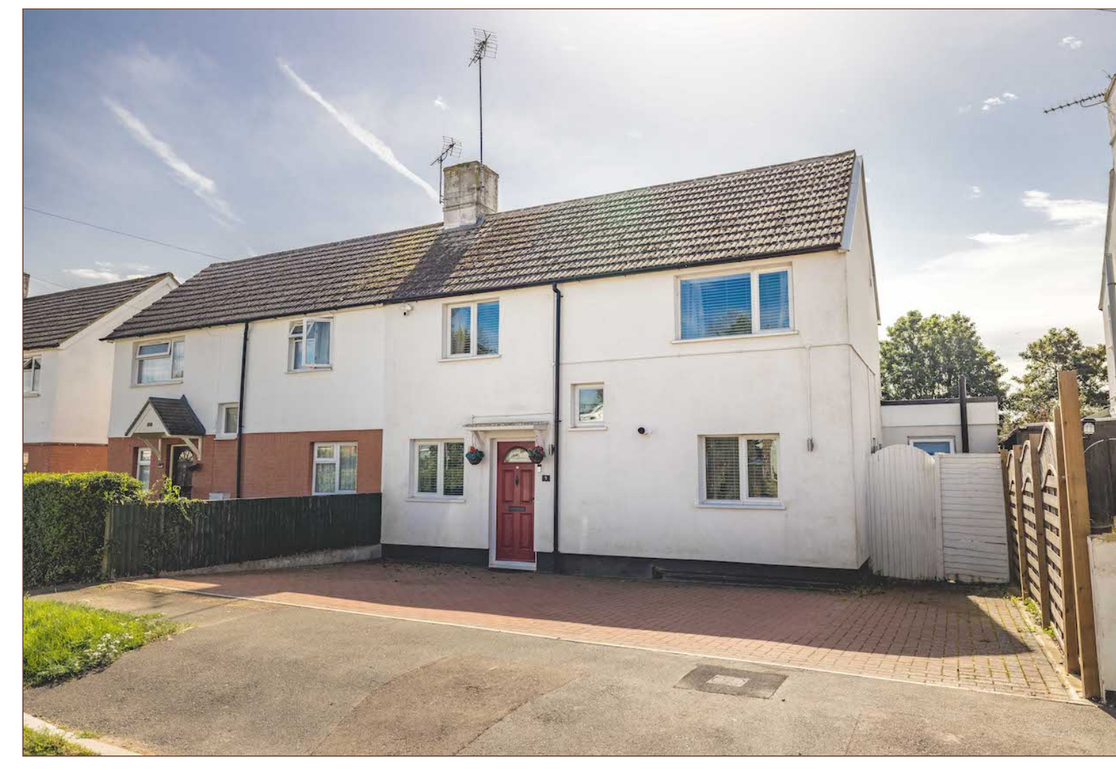
This three/four bedroom semi-detached family home is located on a quiet cul-de-sac off Lent Rise Road and is offered to the market as superbly presented. The property is well positioned within one mile of both Burnham and Taplow Rail Stations (Crossrail).

The ground floor features three reception rooms with the inclusion of a 15ft living room, a 19ft kitchen/diner and a 10ft Study. There is also a WC, an 18ft bedroom, a shower room and entrance hall.