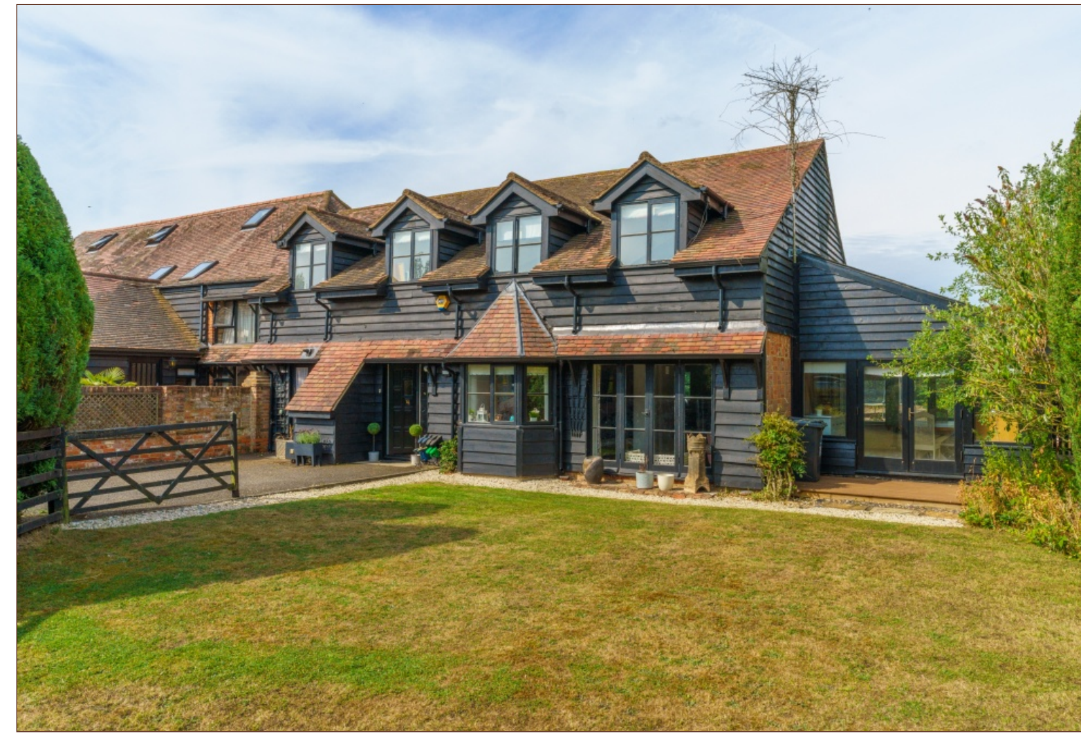
offering picturesque views of the surrounding countryside. The refurbishment of the property has been carried out to a high standard, with careful attention to detail

Upon entering the main reception hall, you are greeted by attractive exposed brickwork and a gallery on the first floor, creating a spacious and welcoming atmosphere. The hall also includes a cloakroom with utility space. The recently installed gas boiler, is conveniently located in the eaves store attached to the front of the property.