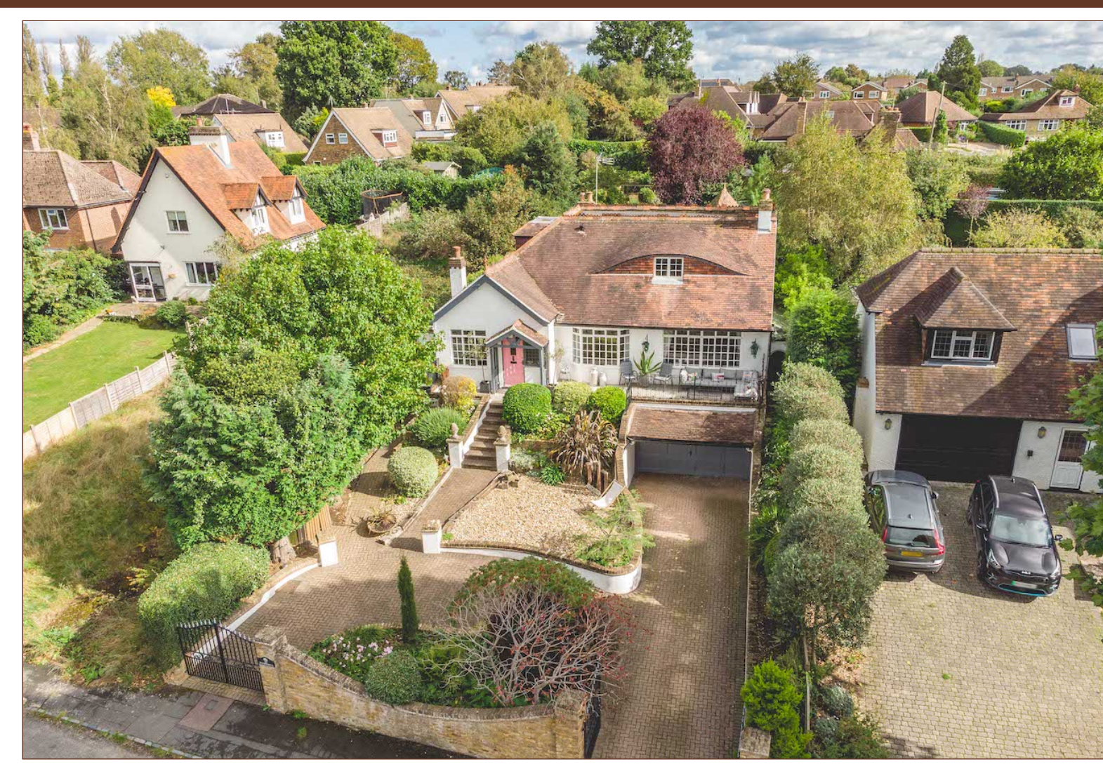
Introducing this stunning property, nestled in a peaceful neighborhood, that offers comfort, elegance, and spacious living. As you approach the house, you'll be greeted by a picturesque carriage-style driveway that not only provides ample parking space but also adds to the overall charm of this home.

Approaching the property, you'll immediately notice the elevated front patio, a lovely spot to enjoy your morning coffee or evening sunset views. The large porch area provides a welcoming entrance and a place to greet guests. This home boasts a well-thought-out layout, including a double bedroom downstairs with built-in wardrobes, making it ideal for guests or as a convenient main-floor bedroom. Adjacent is a tastefully designed bathroom featuring a shower, toilet, and sink, offering both style and functionality.