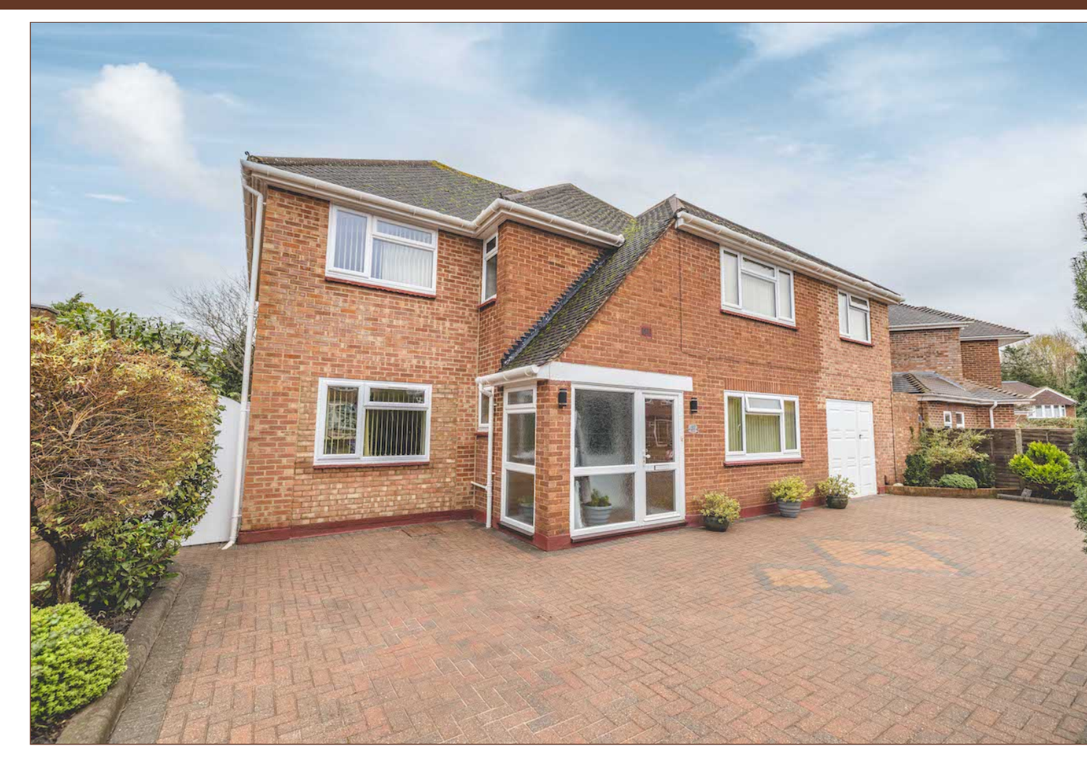
Occupying an admirable plot on this highly sought-after residential street in the Upton Court area of Langley, this four/five bedroom detached property has been expertly extended creating a commodious and adaptable living and storage space for a large family.

The property comprises two large reception rooms including a pleasant 13ft lounge to the front of the house and exceptional 23ft living room/diner overlooking the rear garden. The newly refitted kitchen features a great range of storage units and integrated appliances, whilst benefitting from a separate utility room. The ground floor also offers integral garage, additional storage room and downstairs cloakroom.