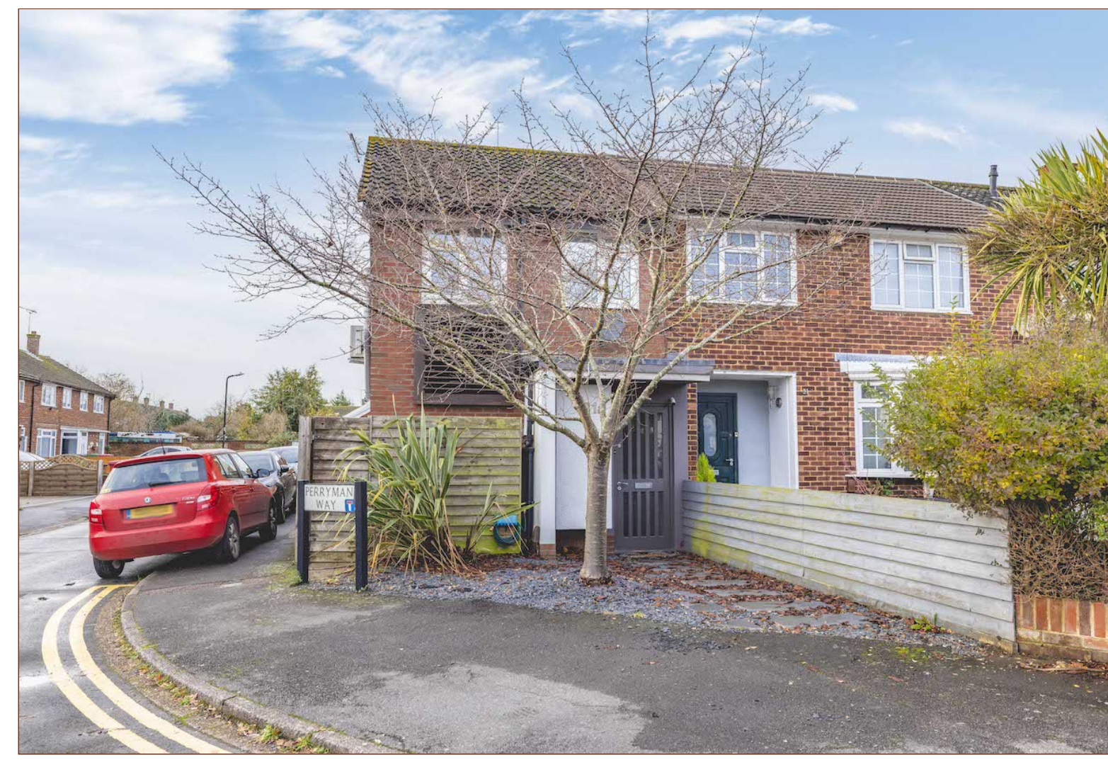
This extended two bedroom end of terrace house is located within a popular residential area and is offered to the market as immaculately presented having been recently renovated throughout and with no onward chain

On the ground floor is an open-plan 25ft living room and kitchen, with doors that open onto the garden. As this level is a half basement, there is a great sense of quiet immersion in the garden. The slate floor is warmed with underfloor heating and the room is flooded with natural light from a cleverly concealed light well. The neat kitchen has polished concrete worktops and plenty of storage. There is also a downstairs WC and a secret bedroom for the family cat. Every detail of the space has been carefully thought through without feeling over-designed.