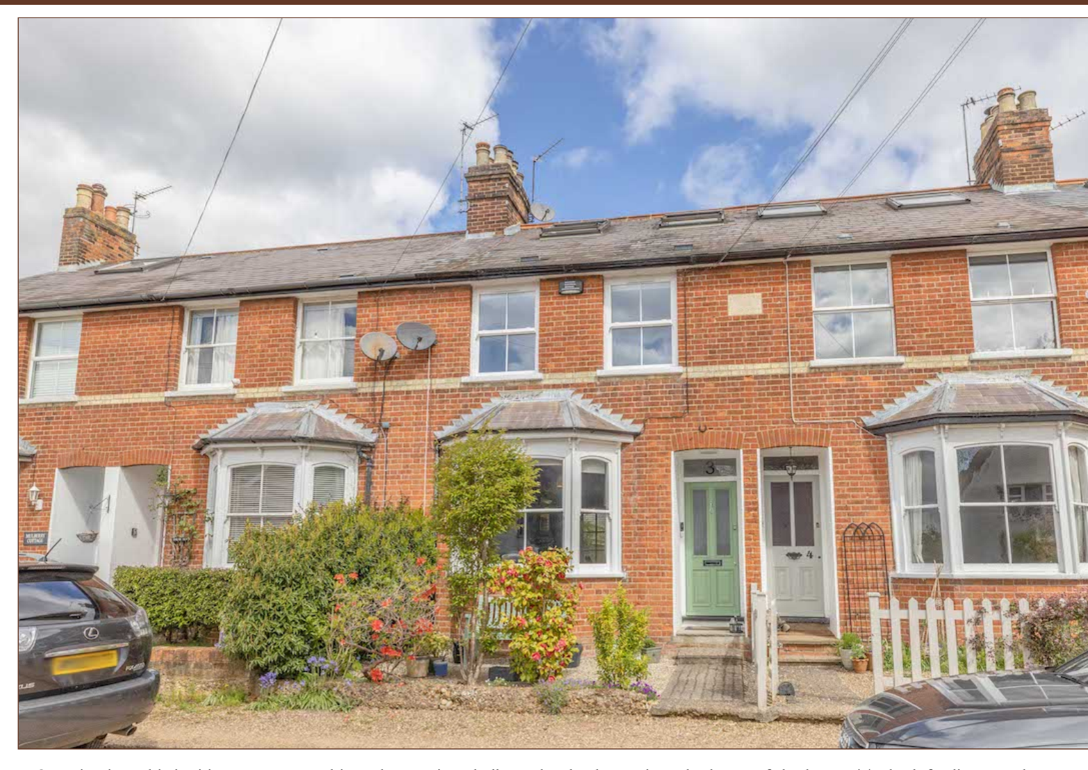
Stepping into this inviting property and into the spacious hallway that leads you into the heart of the home. To the left, discover the expansive living and dining area boasting dual aspects, filling the room with natural light. The bay window at the front offers a picturesque view of the surroundings, adding to the charm of the space.

Continuing through into the well-appointed kitchen, equipped with integrated appliances including a dishwasher, washing machine, tumble dryer, and a convenient fridge freezer. Cooking enthusiasts will appreciate the four-ring induction hob. Adjacent to the kitchen is a cozy snug area featuring a built-in TV unit, seamlessly connected to the outdoor patio through french doors, ideal for al fresco dining and entertaining.