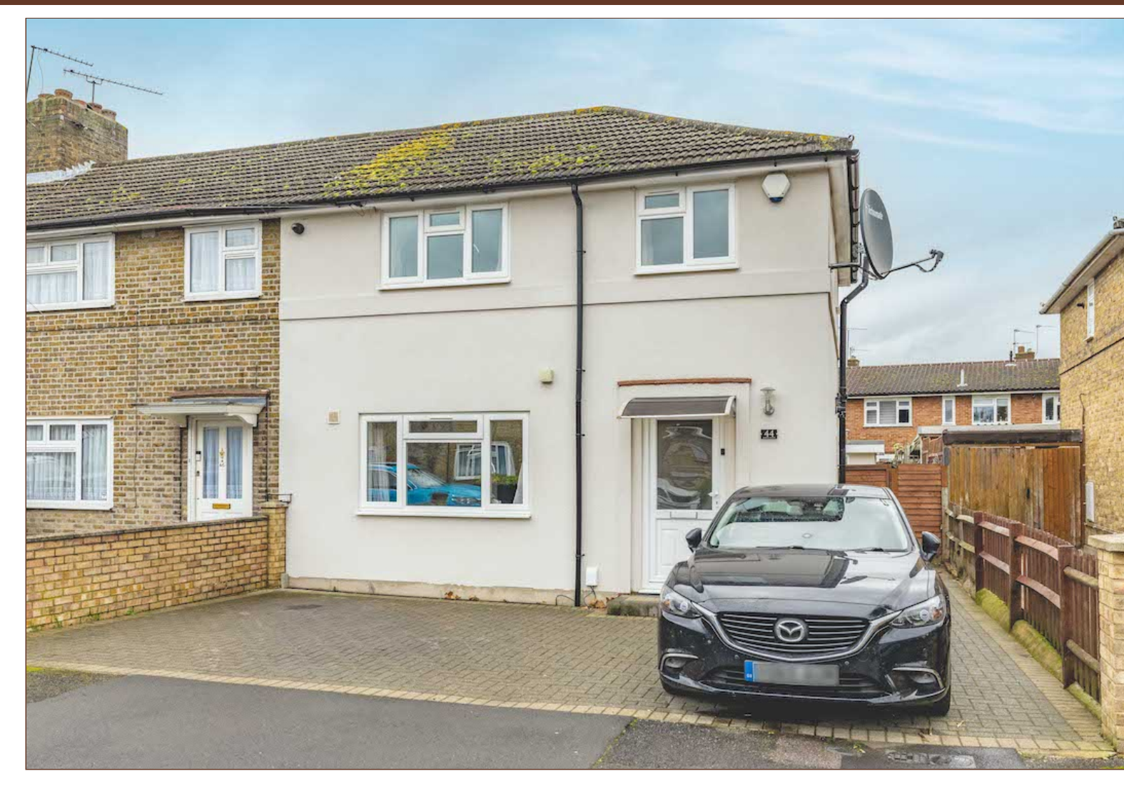
Fusing cutting-edge design with clean lines and state-of-the-art appointments this extended three bedroom semi detached property leaves no stone unturned with a complete renovation from top to toe, in this quite residential area close to local schools.

Boasting an open plan area downstairs combining the dining, living and high gloss contemporary kitchen with white granite work surfaces, two skylights, air conditioning. There is also a further downstairs reception room currently being used as a downstairs bedroom and contemporary three-piece shower room.