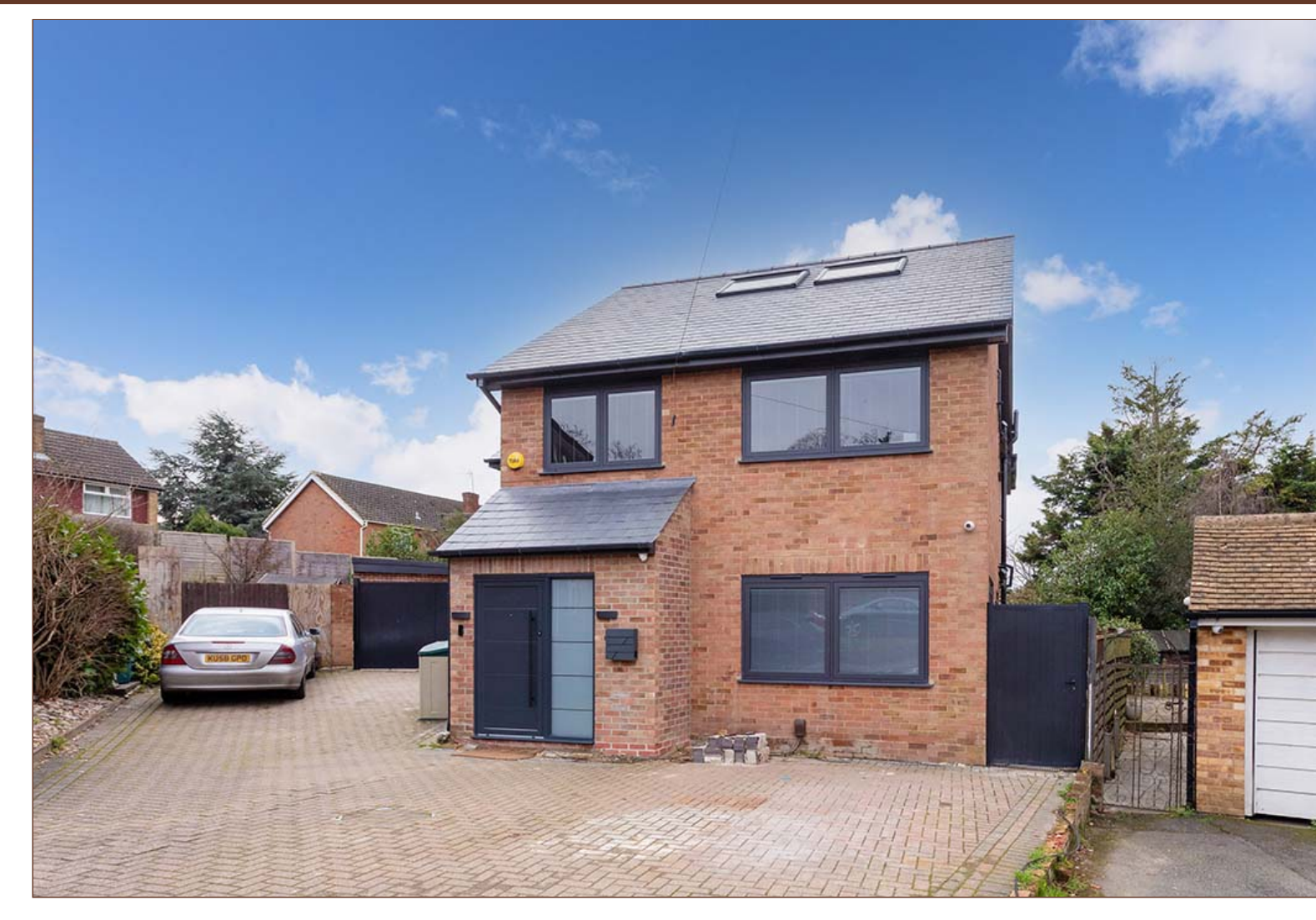
The ultimate in luxury living, this wonderful four bedroom detached family home is a statement in innovative design and stylish contemporary finishes. The property is nestled in a quite cul-de-sac location, convenient to schools, shops, and transport.

Boasting a 22FT sitting room with folding doors connecting a 30FT kitchen/ family room, five bathrooms, a balcony overlooking farmland and outhouse used as office space with en-suite shower room. The block paved parking provides parking for two/ three cars and electric gates lead to a potential further parking for up to three to four cars.