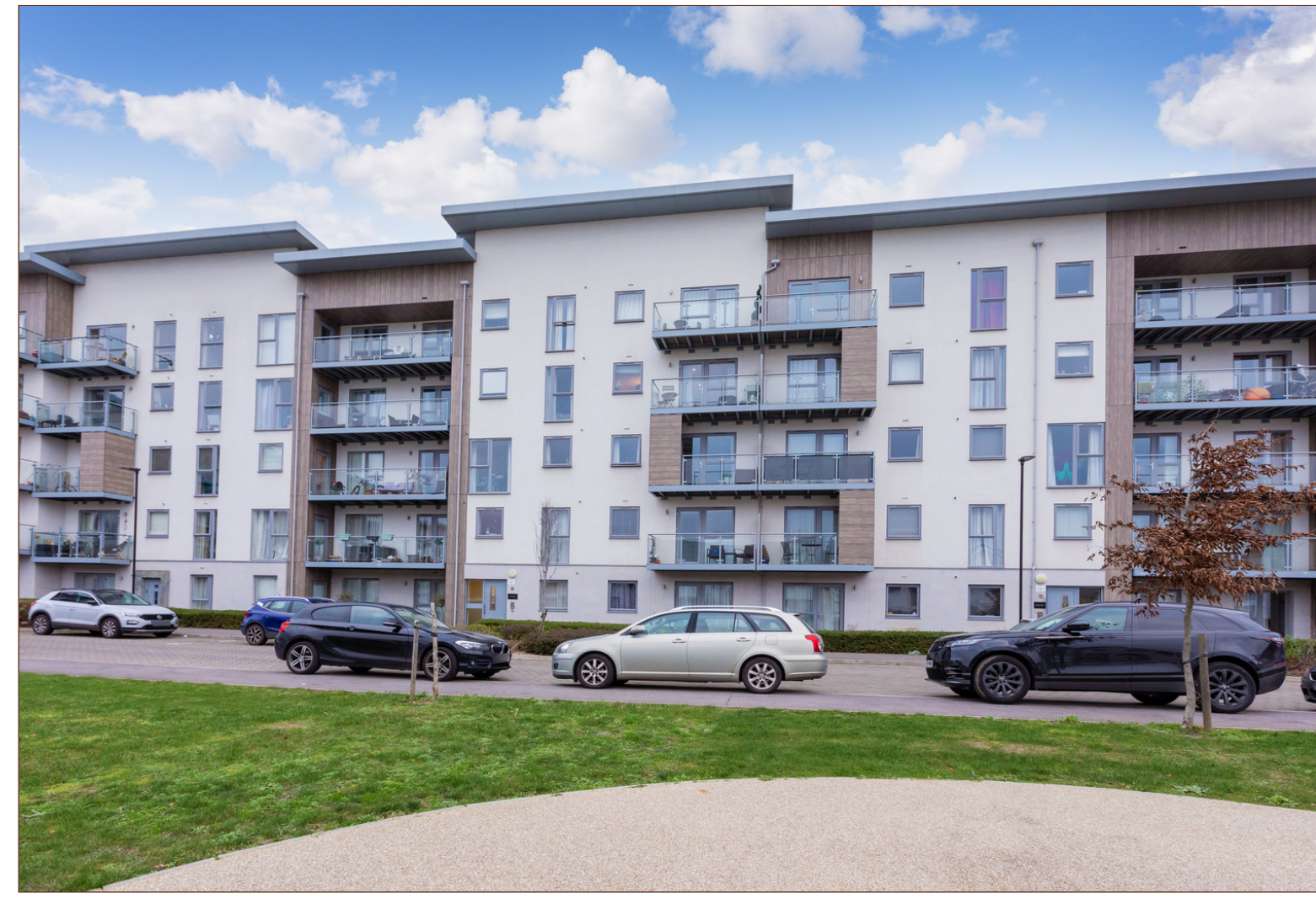
Offered to the market with NO ONWARD CHAIN.

A modern 2nd floor one bedroom apartment situated in this sought-after development only a short walk to the town centre and Maidenhead station (Paddington/Elizabeth Line). This spacious property features a large double bedroom with fitted wardrobes, modern bathroom suite, allocated parking and a generous open plan living/dining/kitchen area leading onto a private balcony with space for a table and chairs. An ideal first time buy or investment purchase.