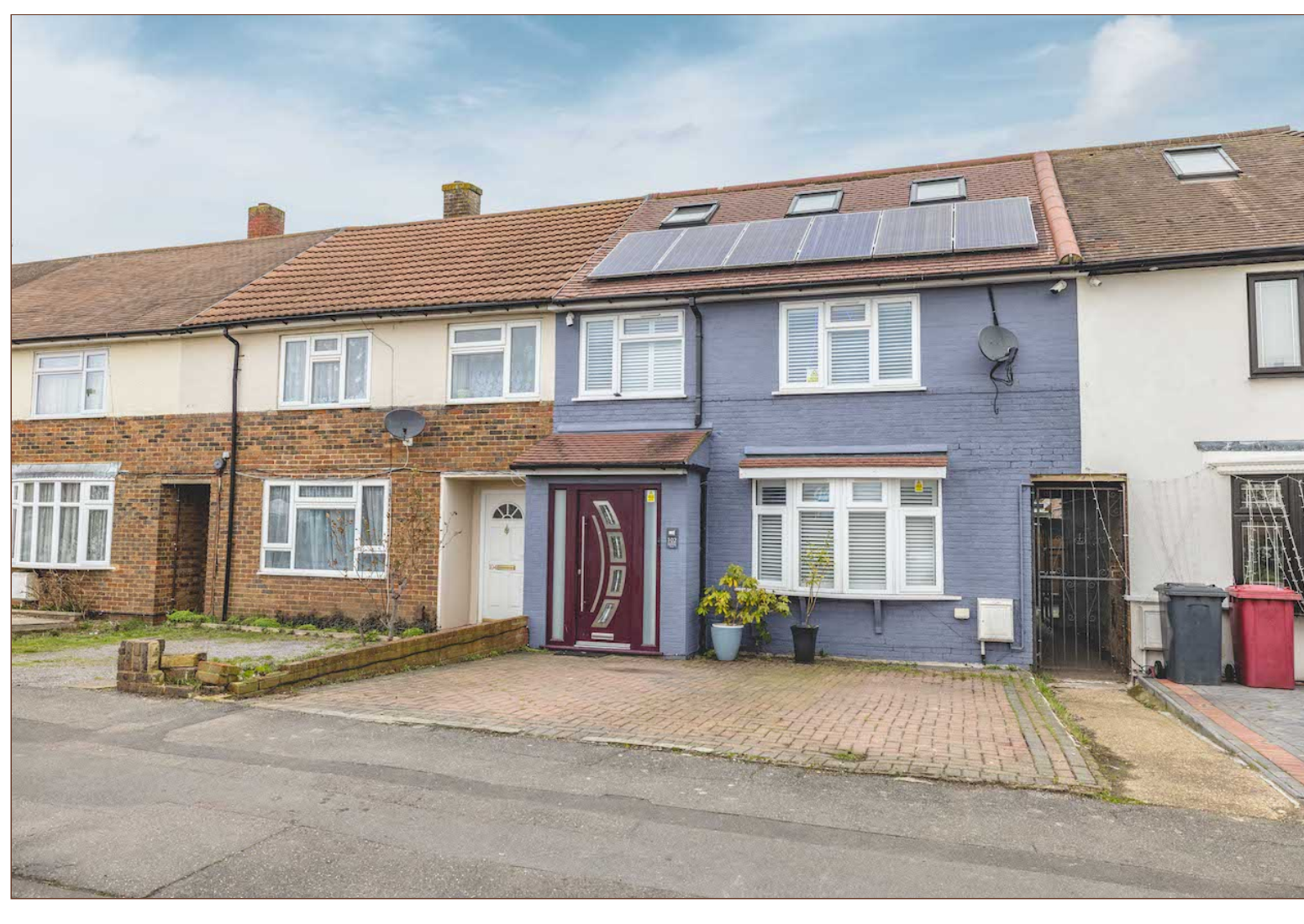
This extended four bedroom terraced house is well located for access to Burnham Train Station (Queen Elizabeth Line) and is nearby a range of local shops and transport links including the M4, M40 and M25 networks. The property is set over three floors and is offered to the market as superbly presented.

The ground floor features a 21ft lounge/diner, a 17ft granite fitted kitchen, a 14ft conservatory, a shower/W.C, and a large entrance hall.