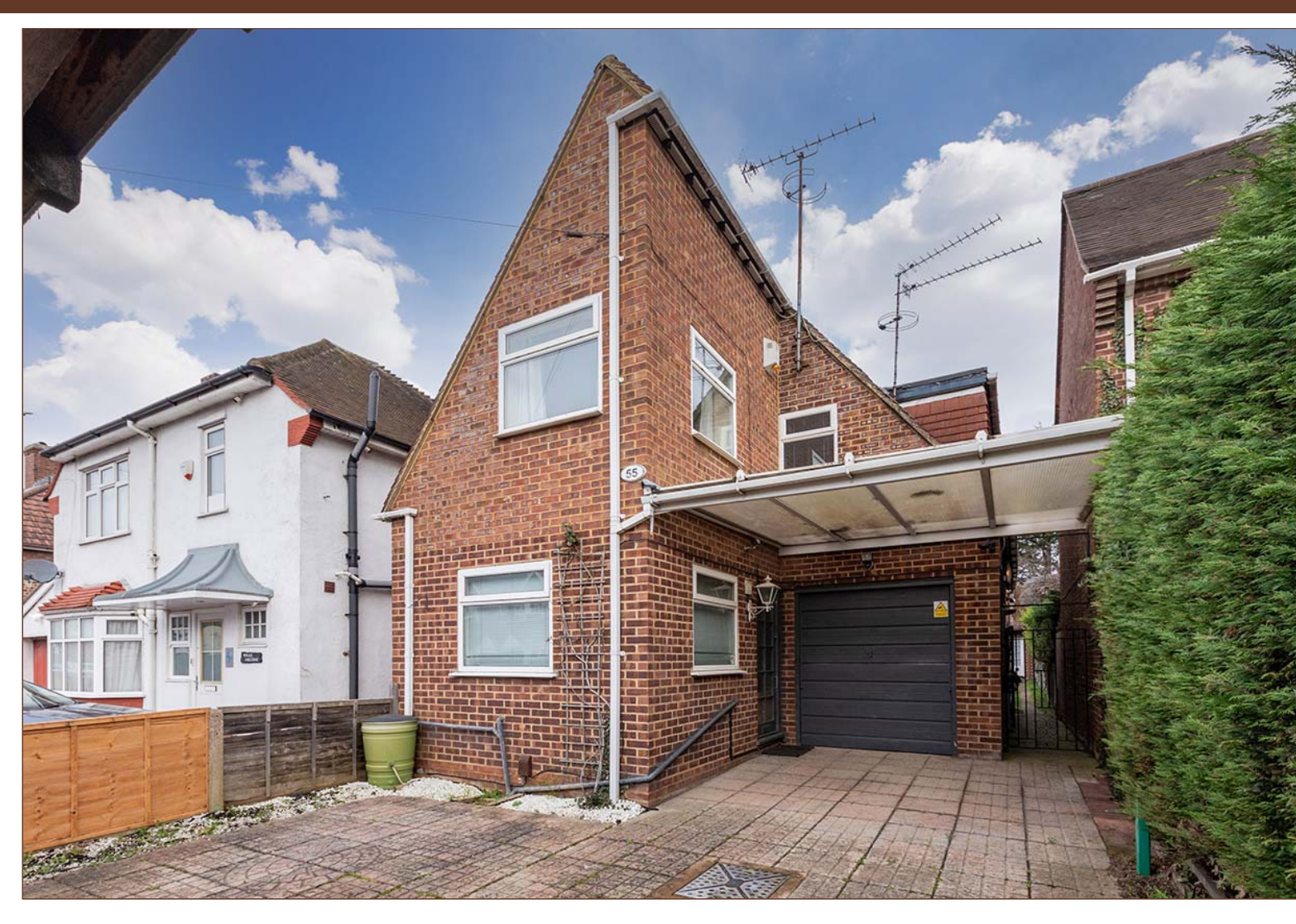
Sitting on a large plot on Meadfield Road, this four bedroom detached property also benefits a duplex annexe at the back of the garden, with its own kitchen, living areas, bathroom, conservatory and upstairs bedroom, perfect for adaptable family accommodation, or an excellent HMO potential.

The main property comprises an east-facing side entrance leading directly into the kitchen. The hallway then leads to a family bathroom, spacious 16ft reception area with ample space for living and dining furniture, opening to a large double-storey conservatory.