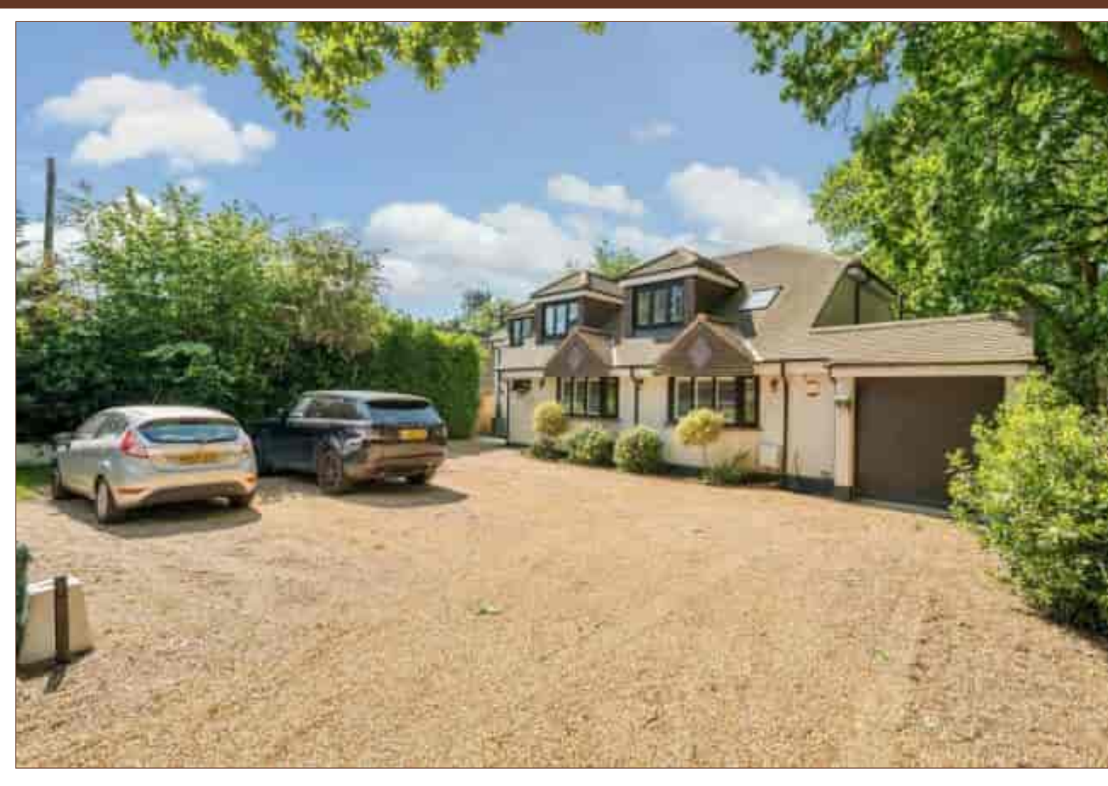
Superbly designed and renovated by the current owners this FOUR double bedroom detached family home comes to the market in excellent turn key condition. Located in an ideal setting, close to all the major access routes of Maidenhead this stunning property offers ample and versatile living and entertaining space over two floors

To the ground floor, the elegant hallway leads to a stylish and well appointed kitchen/diner with bi fold doors providing access to the patio and garden. Within the kitchen, there is a central island, an array of floor to ceiling cupboards and space for large formal dining table. Behind the kitchen is a very useful utility room leading to the garage which has been converted into a gym/storage space. The main reception room is highlighted by a feature fireplace and enjoys views out onto the garden, there is also a spacious bedroom with fully fitted en suite bathroom, a further reception room and a wc.