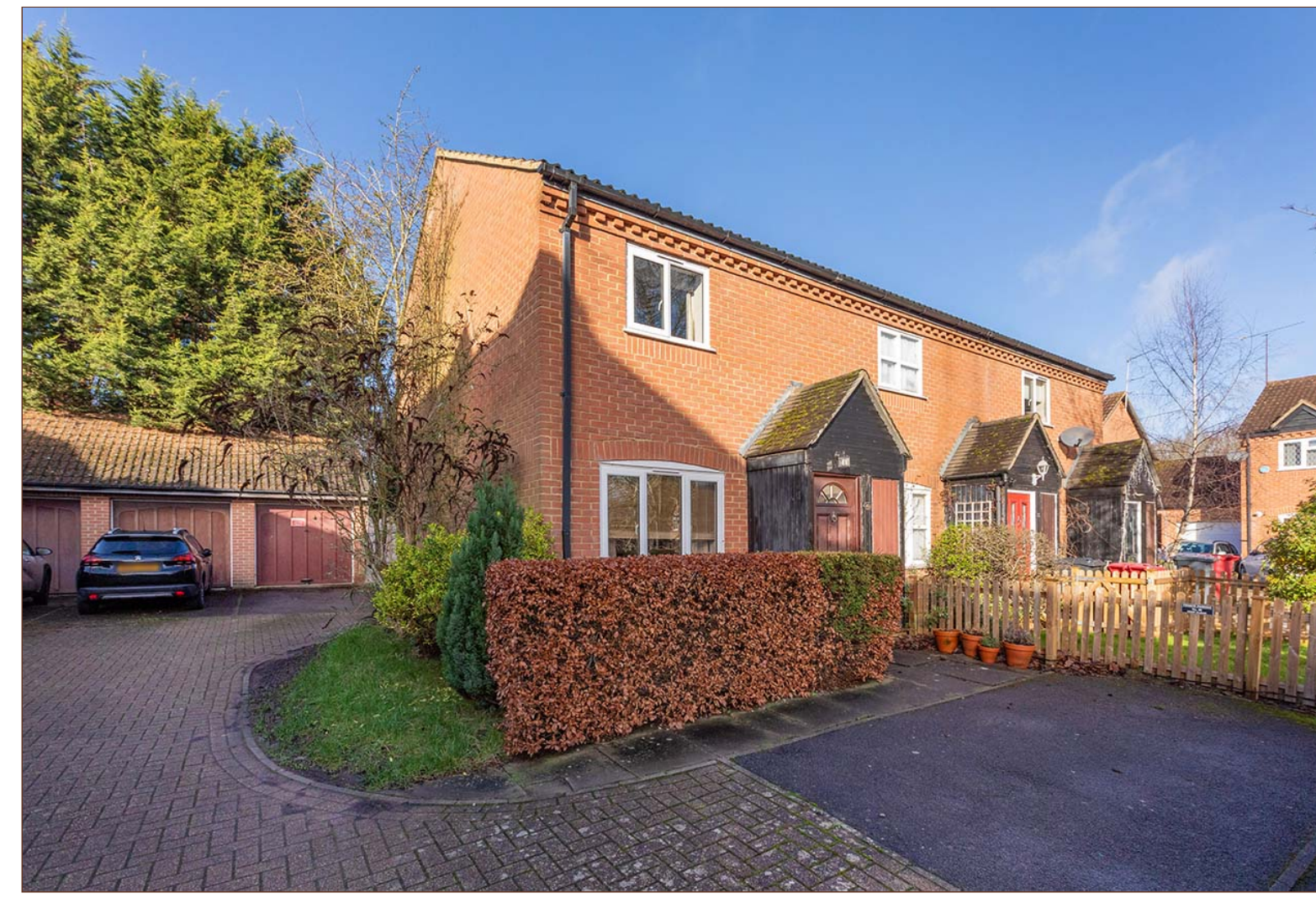
This two double bedroom semi-detached house is quietly situated within a short walk of Burnham Rail Station (Queen Elizabeth line) and is next to the Haymill Valley nature reserve.

The ground floor features a 13ft sitting room, a 13ft fitted kitchen and a downstairs claokroom.