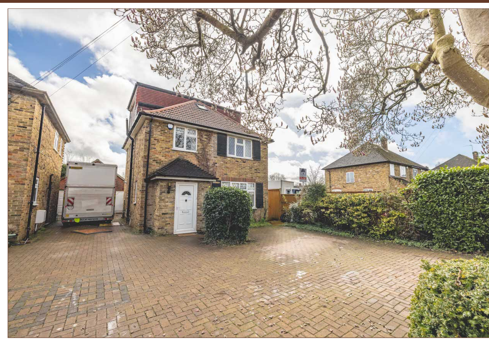
Oakwood Estates proudly offers this immaculately renovated and expanded four-bedroom, two-bathroom detached home with two reception rooms. Boasting a spacious garage with ample overhead storage, a charming summer house, and a rear garden facing southeast, it also features driveway space for a minimum of four vehicles. Conveniently located near schools, amenities, and a local park, this property promises comfortable living in a desirable neighbourhood.

Upon entering the property, you step into the entrance porchway, which leads to the inner hallway and offers a view of the front aspect through its window. The hallway boasts pendant lighting, a frosted window overlooking the side aspect, and stairs ascending to the first floor, with a convenient downstairs WC tucked underneath. From here, doors lead to both the living room and the spacious kitchen/dining room, with carpeting throughout. The living room, measuring 14'4" x 12'5", presents a generously sized window overlooking the front aspect, complemented by pendant lighting and ample space for a three-piece suite. The open-plan kitchen/dining room, measuring 16'1" x 21'7", is adorned with spot and pendant lighting, offering a bright and inviting atmosphere. It features a window and bi-folding door leading to the rear garden, a blend of wall-mounted and base kitchen units, provisions for an American-style fridge/freezer, integrated oven and grill, gas hob with extractor fan above, sink with mixer tap, a kitchen island/breakfast bar, and ample space for both dining and relaxation, all finished with tiled flooring.