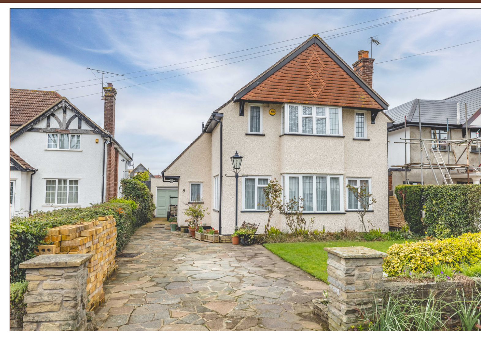
Oakwood Estates is excited to offer a unique chance to acquire this charming, chain-free three-bedroom detached residence located in the heart of Richings Park. Boasting a Large Kitchen, two reception rooms, downstairs W.C., off-street parking and a garage for 3-4 cars. It has fantastic potential for an extension (subject to planning permission) This residence is conveniently located just a brief stroll from Iver Station (Crossrail/Elizabeth Line).

Upon stepping into the property, you are greeted by a welcoming entrance hallway featuring a staircase leading to the first floor, with doors opening to both the living room and kitchen. The kitchen, positioned to the left, presents a large rear-facing window offering views of the expansive garden. It includes a mix of wall-mounted and base kitchen units, complete with an integrated oven and grill. The kitchen also offers ample space for white goods, generous countertop space, a gas hob with an extractor fan overhead, a sink with a mixer tap, and tiled flooring. Additionally, there's enough space for a table and chairs should you wish. Adjacent to the kitchen lies the spacious dining room, boasting French doors that open onto the patio. The room comfortably accommodates a dining table and chairs, with extra space available for a desk and settee. The flooring is carpeted, adding to the cosy ambience. The living room is adorned with dual-aspect windows, filling the space with natural light and providing views of both the front aspect and the charming tree-lined street. Pendant lighting illuminates the room, while an ornate fireplace adds character. There's ample room for a couple of sofas, and the flooring is carpeted for comfort.