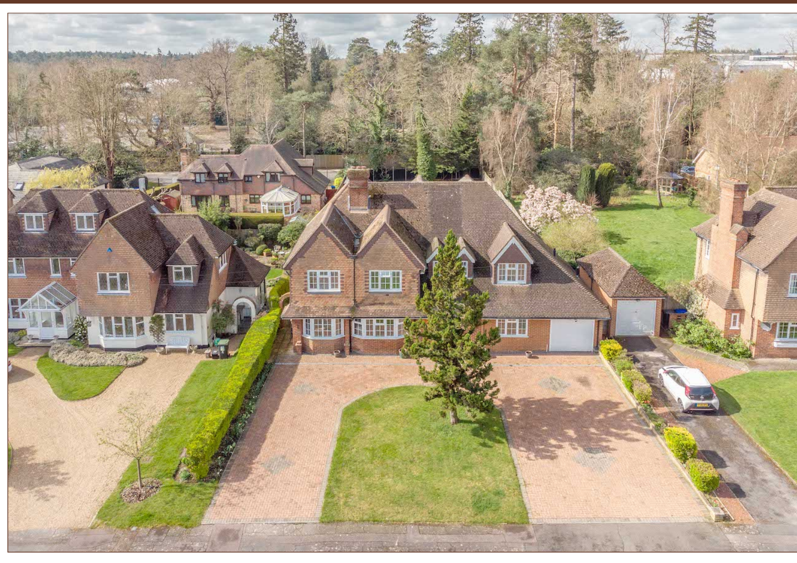
Oakwood Estates is thrilled to showcase this magnificent detached property to the market, boasting 6 bedrooms, 5 bathrooms, and 3 reception rooms. Nestled in a serene cul-de-sac, this property offers tranquillity and privacy. Additionally, it comes with a garage, ample parking space for over 7 cars, and a generously sized rear garden with a potential plot at the end with access to Pinewood Road The property is situated on an impressive plot of 0.327 Acres and has an huge potential to build another property at the rear of the garden (STPP), providing abundant space for outdoor activities and enjoyment. Its convenient location ensures easy access to transportation, Uxbridge Underground Station stands at a distance of 1.96 miles, Crossrail/Elizabeth train stations are also within close proximity with Langley Station just 3.1 miles away and Iver Station a mere 2.62 miles away, enhancing the property's accessibility and commuting options.