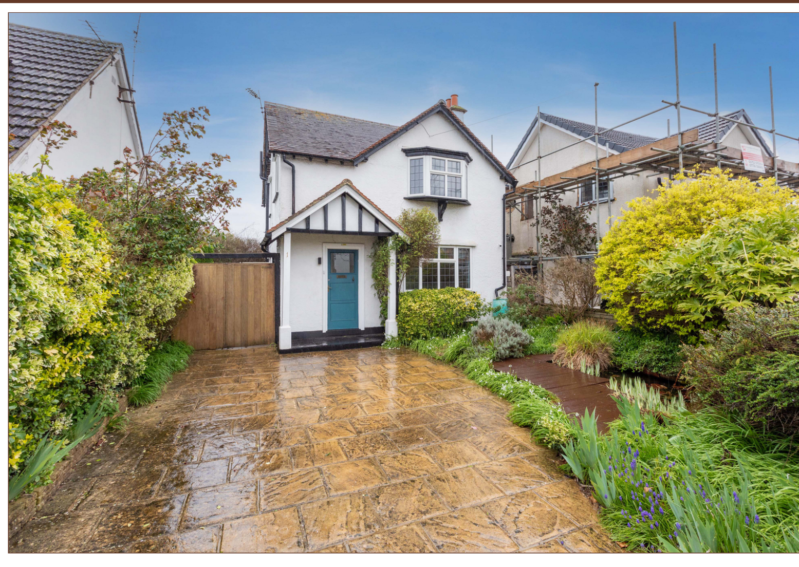
Situated a short walk of three local grammar schools on this popular residential road, this traditional detached house offers three bedrooms and ample outdoor space to both front and back of the property.

The house benefits an existing single rear extension, whilst boasting lots of potential for future double side, double rear and loft extensions (STPP).