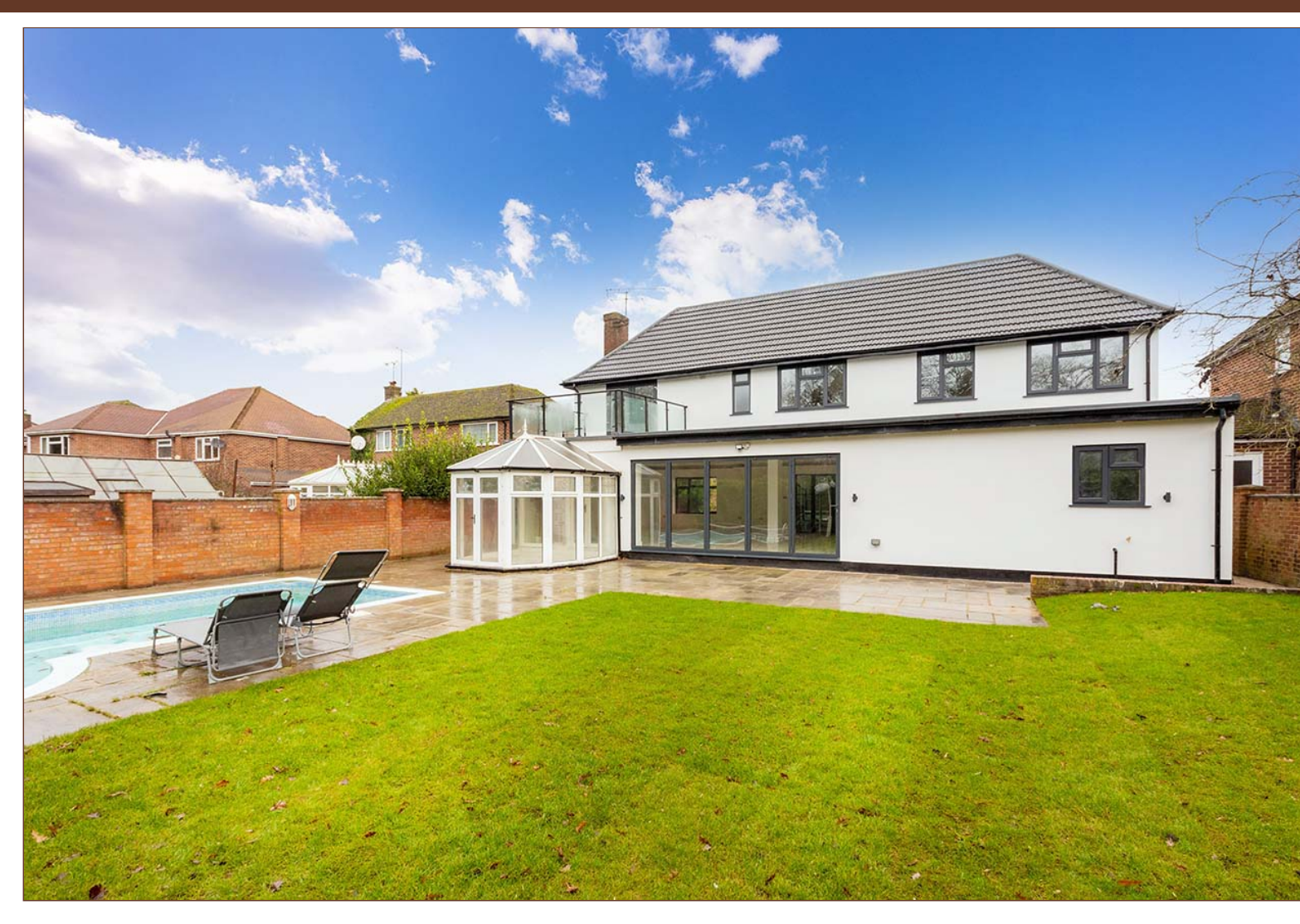
Nestled within a quiet cul-de-sac just off the highly desirable Marlborough Road, this five bedroom detached house occupies a substantial plot and has been proficiently extended to create generous living space suitable for a large family.

The property has been newly renovated to an extremely high standard, ideal for those looking for an immediate move. A spacious entrance hallway offers access to a downstairs cloakroom and has been fitted with spotlights and large marble-effect floor tiles with underfloor heating that extends throughout the ground floor.