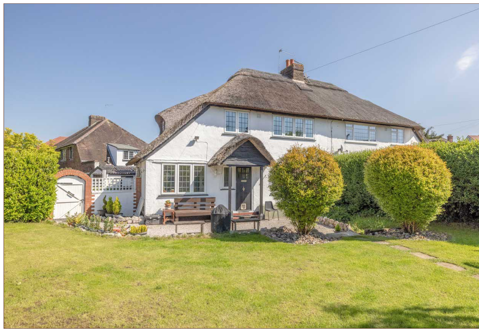
blend of British countryside charm and modern amenities. Nestled in the heart of Richings Park, it enjoys a prime location, just a short stroll to Iver Station (Crossrail/Elizabeth Line) and nearby shops.

This semi-detached family home boasts three bedrooms, three reception rooms, one bathroom with a separate shower and bath, and two toilets, providing ample space for comfortable living. Additional highlights include off-street parking, a garage, a fully-insulated 44mm timber outbuilding ideal for a home office or additional living space throughout the year, and an enchanting courtyard and sunny enclosed garden, ensuring privacy and tranquillity for your family.