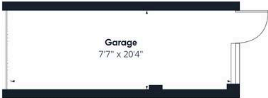
Floor 0 Building 2