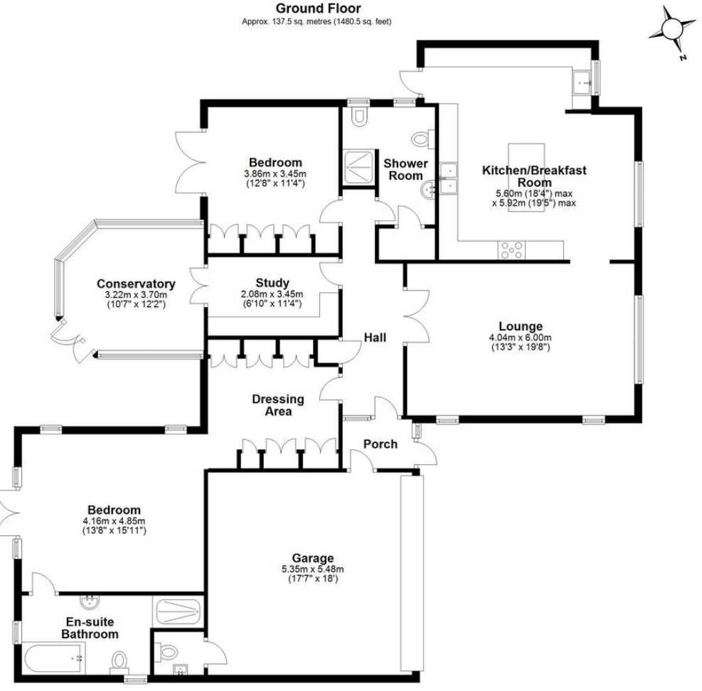
Total area: approx. 137.5 sq. metres (1480.5 sq. feet)

This floor plan is for illustration purposes only, this is not intended to be a measured/scaled survey or comply with RICS guidelines. All measurements (including total floor area) openings, orientation and floor area are approximate. No details are guaranteed, they cannot be relied upon for any purpose and do not form part of any agreement. A party must rely upon its own inspection(s). No responsibility is taken for any error, omission, or mis-statement. Plan produced using PlanUp.