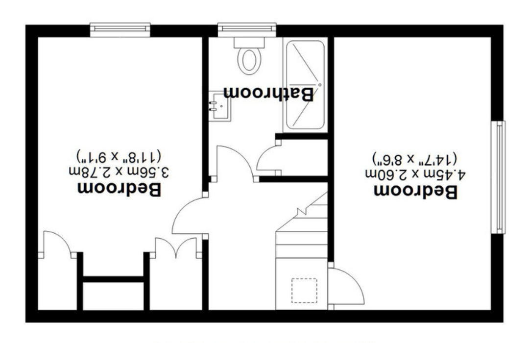
First Floor Approx. 33.9 sq. metres (365.1 sq. feet)