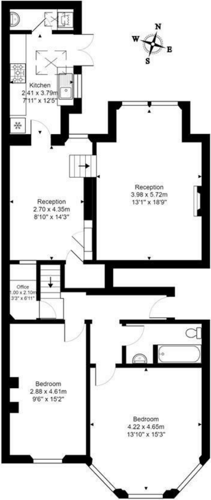
Ground Floor Area: 98.4 m 2 ... 1059 ft 2