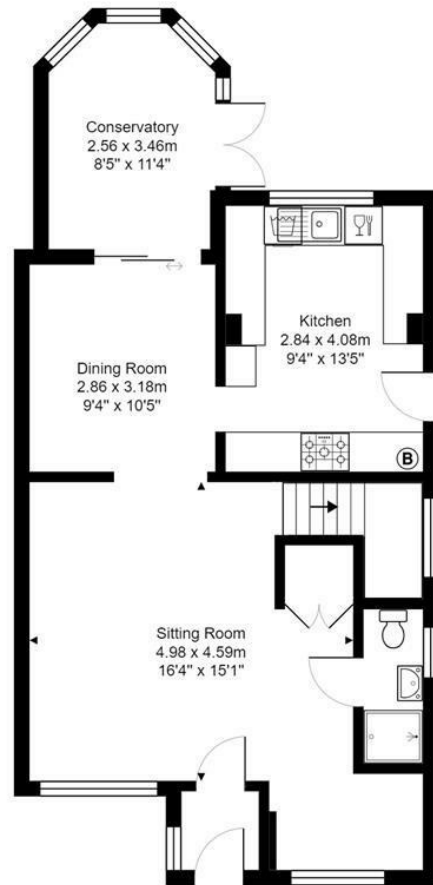
Ground Floor Area: 64.9 m 2 ... 698 ft 2