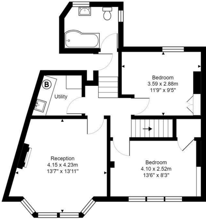
First Floor Area: 54.5 m 2 ... 587 ft 2