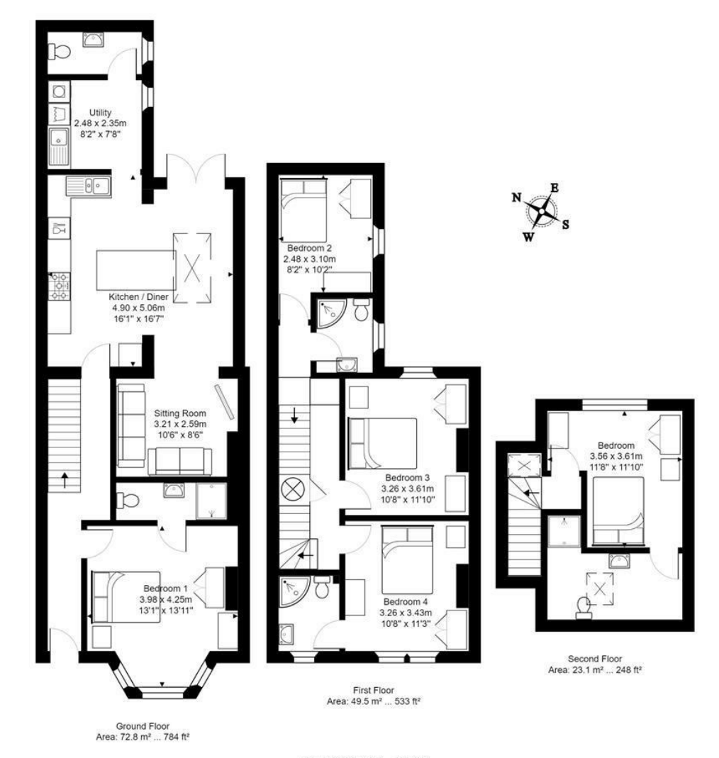
Total Area: 145.4 m² ... 1565 ft²

All measurements of walls, doors, windows, fittings and appliances, their size and locations are approximate and cannot be regarded as being an accurate representation neither by the vendor nor their agent. www.inovusproperty.co.uk