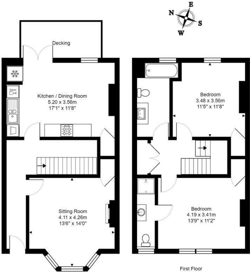
Raised Ground Floor Area: 48.2 m 2 ... 518 ft 2