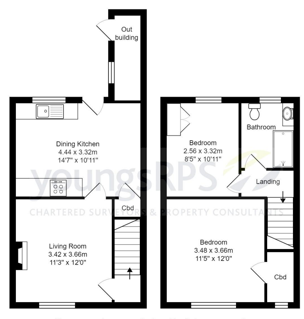
All measurements are approximate and for display purposes only.

IMPORTANT NOTE: Consumer Protection from Unfair Trading Regulations 2008 and the Business Protection from Misleading Marketing Regulations 2008: We endeavour to make our sales particulars accurate and reliable. They should be considered as general guidanceonly and do not constitute allor any part of the contract. None of these rices, fittings and equipment have been tested. Measurements, where given, are approximate and for descriptive purposes only. Boundaries cannot be guaranteed and must be checked by solicitors prior to exchange of contracts. Prospective buyers and their advisers should satisfy themselves as to the facts, and before arranging an inspection, availability. Further information on points of particular importance can be provided. No person in the employment of YoungsRPS (NE) Ltd has any authority to make or give any representation or warranty what ever in relation to this property.