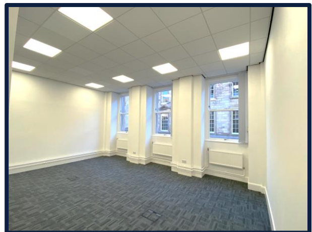
Typical Office Suite

If required, the tenant will have the option to break the lease at the end of the third year of the term upon at least six months' notice.