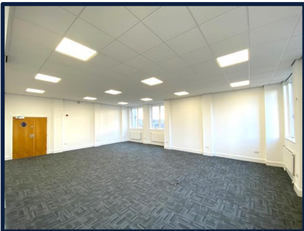
Typical Office Suite

Please see the schedule for available accommodation.