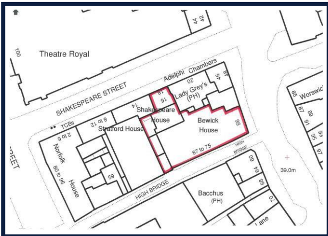
Detailed site plan