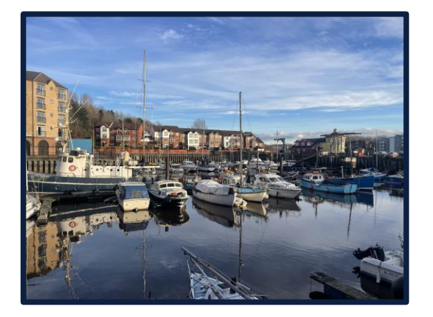
View of St Peter's Wharf