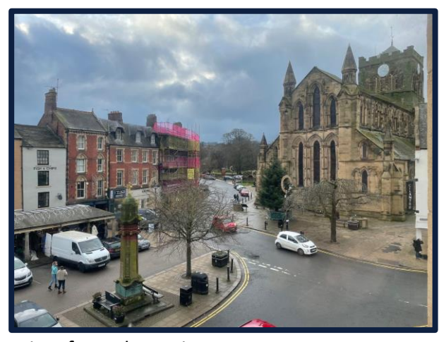
View from the maisonette