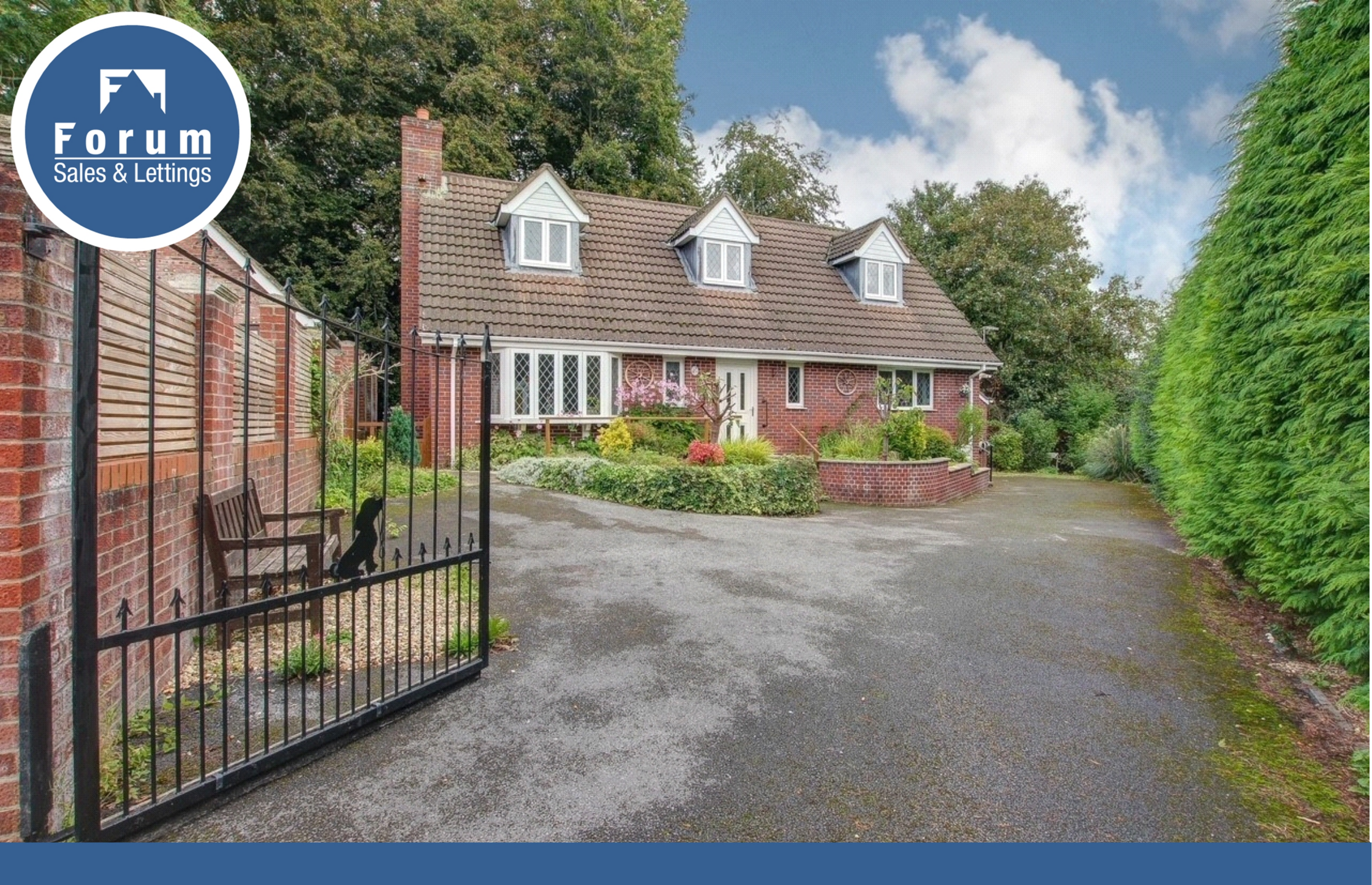
52a Philip Road, Blandford Forum, Dorset, DT11 7NT