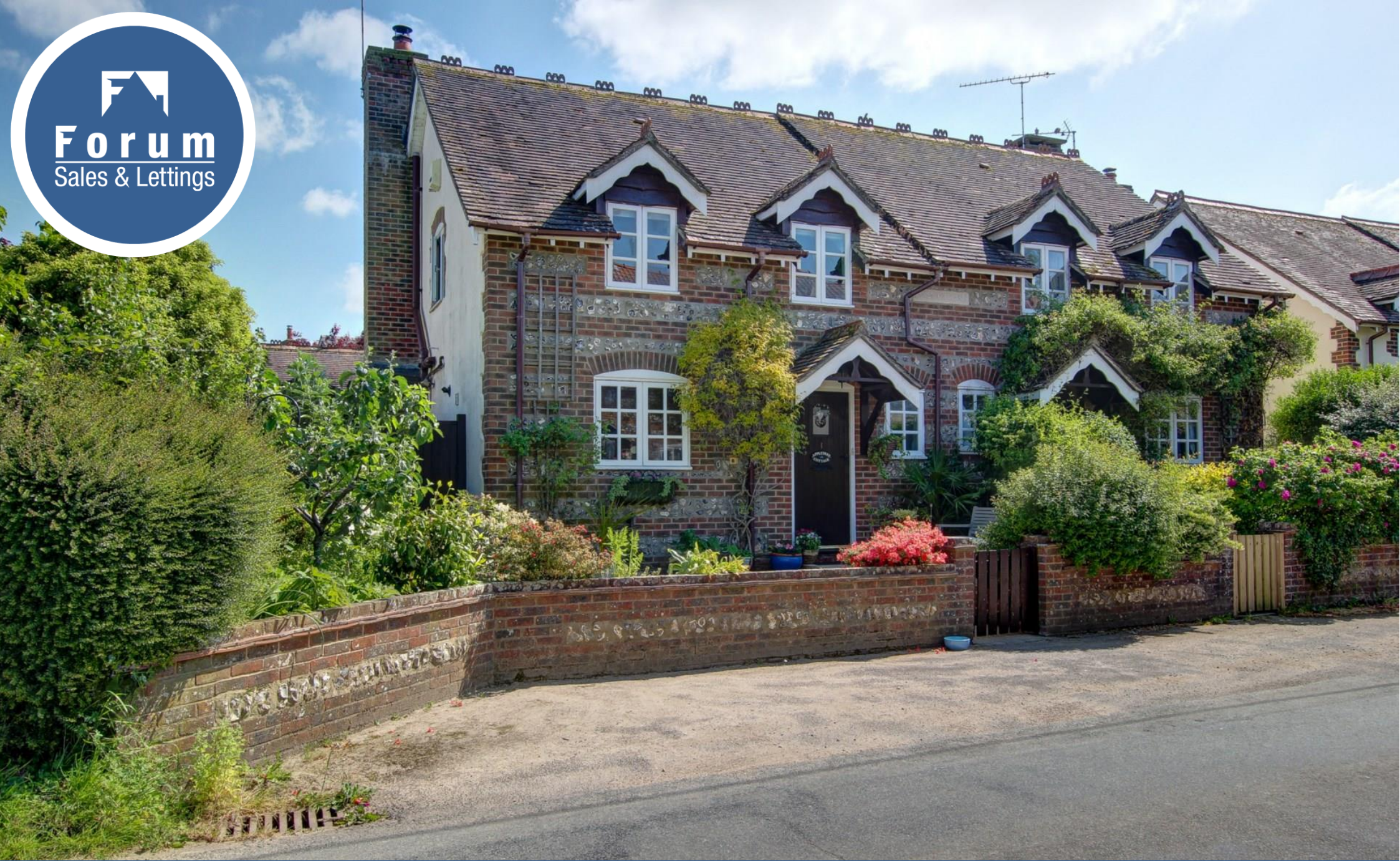
Apple Tree Cottage, West Street, Winterborne Kingston, Dorset, DT11 9AX