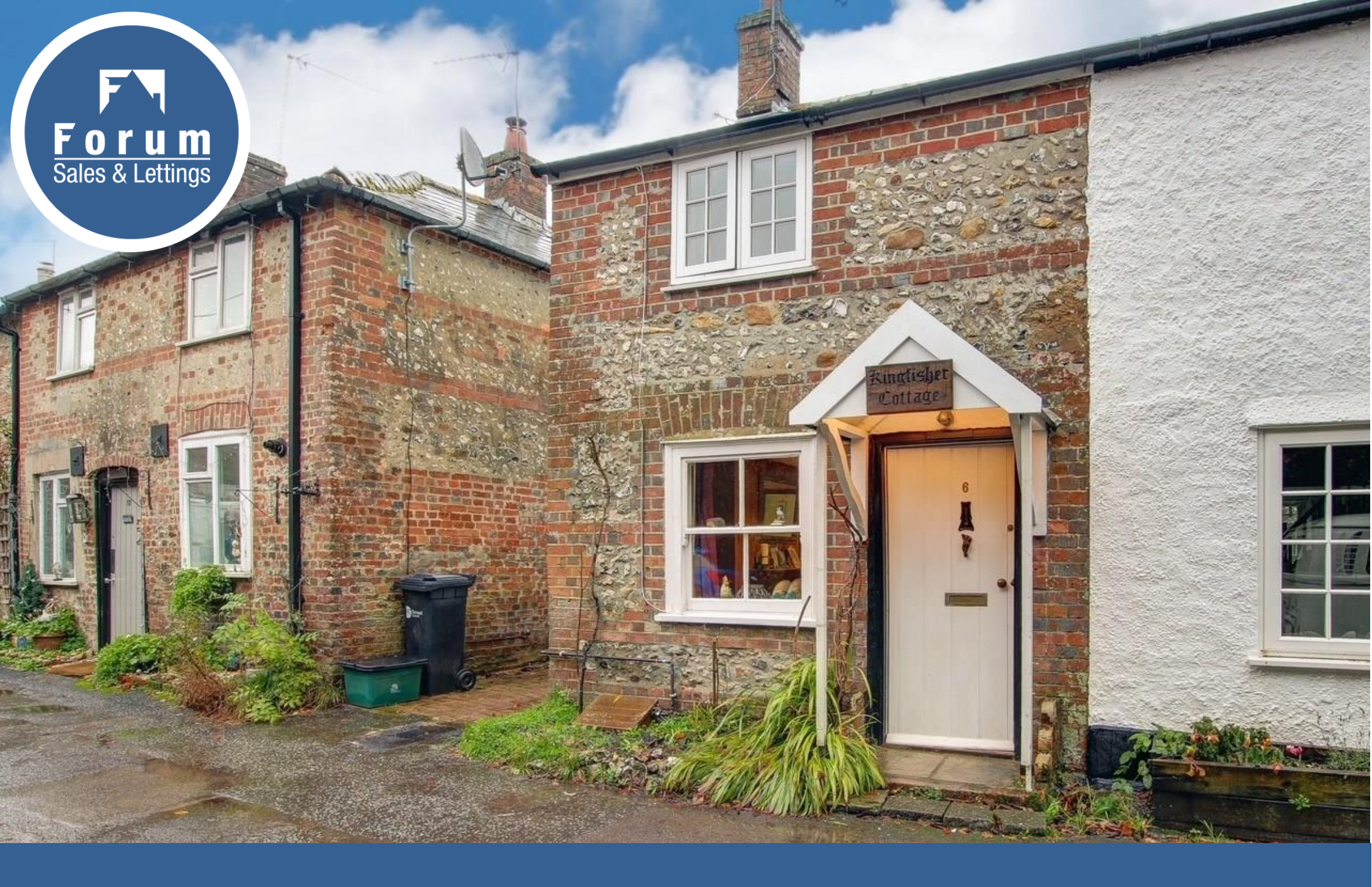
Kingfisher Cottage, 6 Gravel Lane, Charlton Marshall, Dorset, DT11 9NS