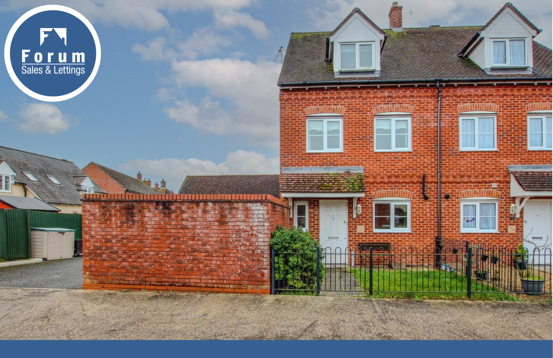
5 Hill Road, Blandford Forum, Dorset, DT11 7XS