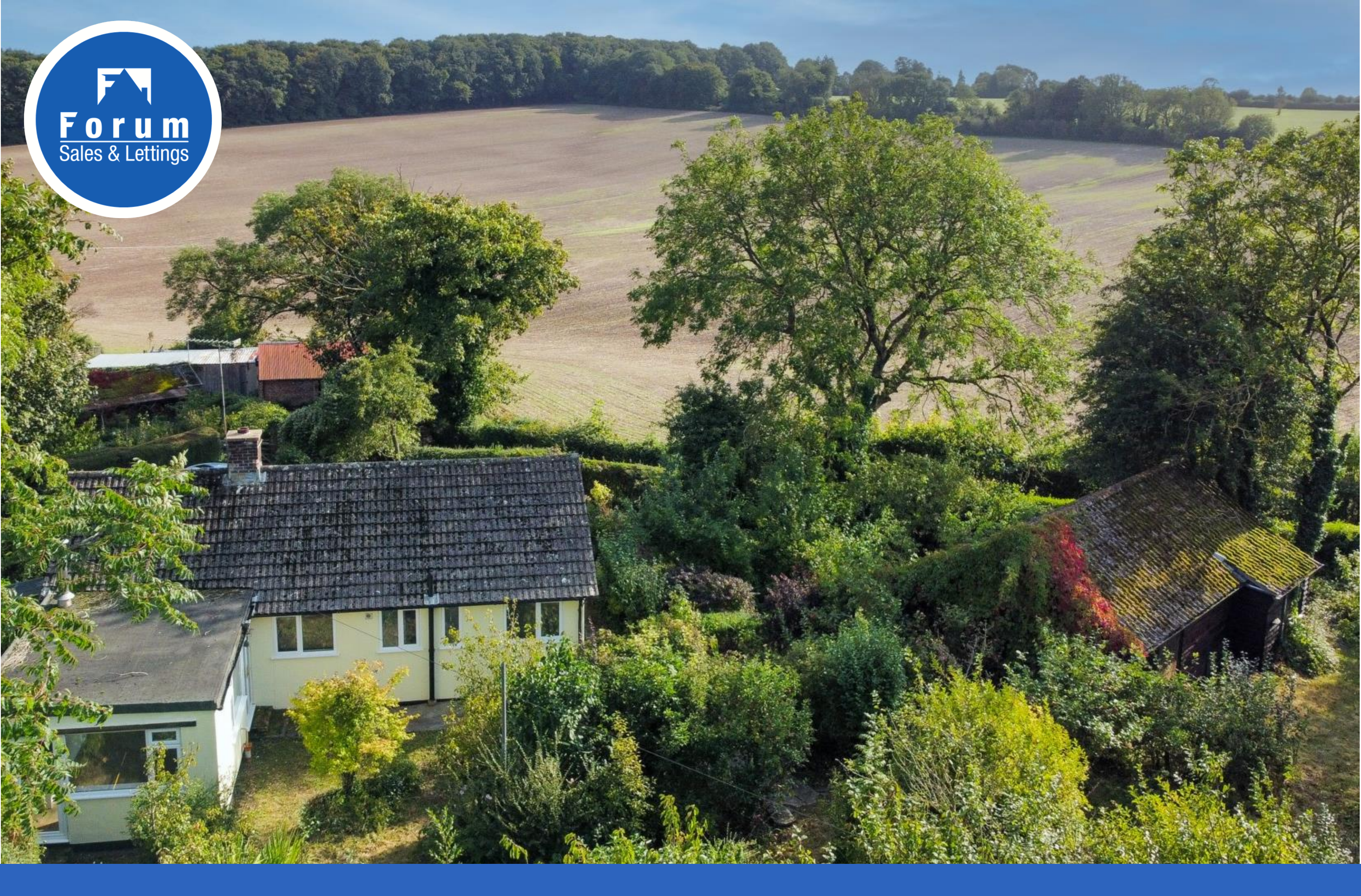
Orchard Cottage, Thornicombe, Blandford Forum, Dorset, DT11 9AH