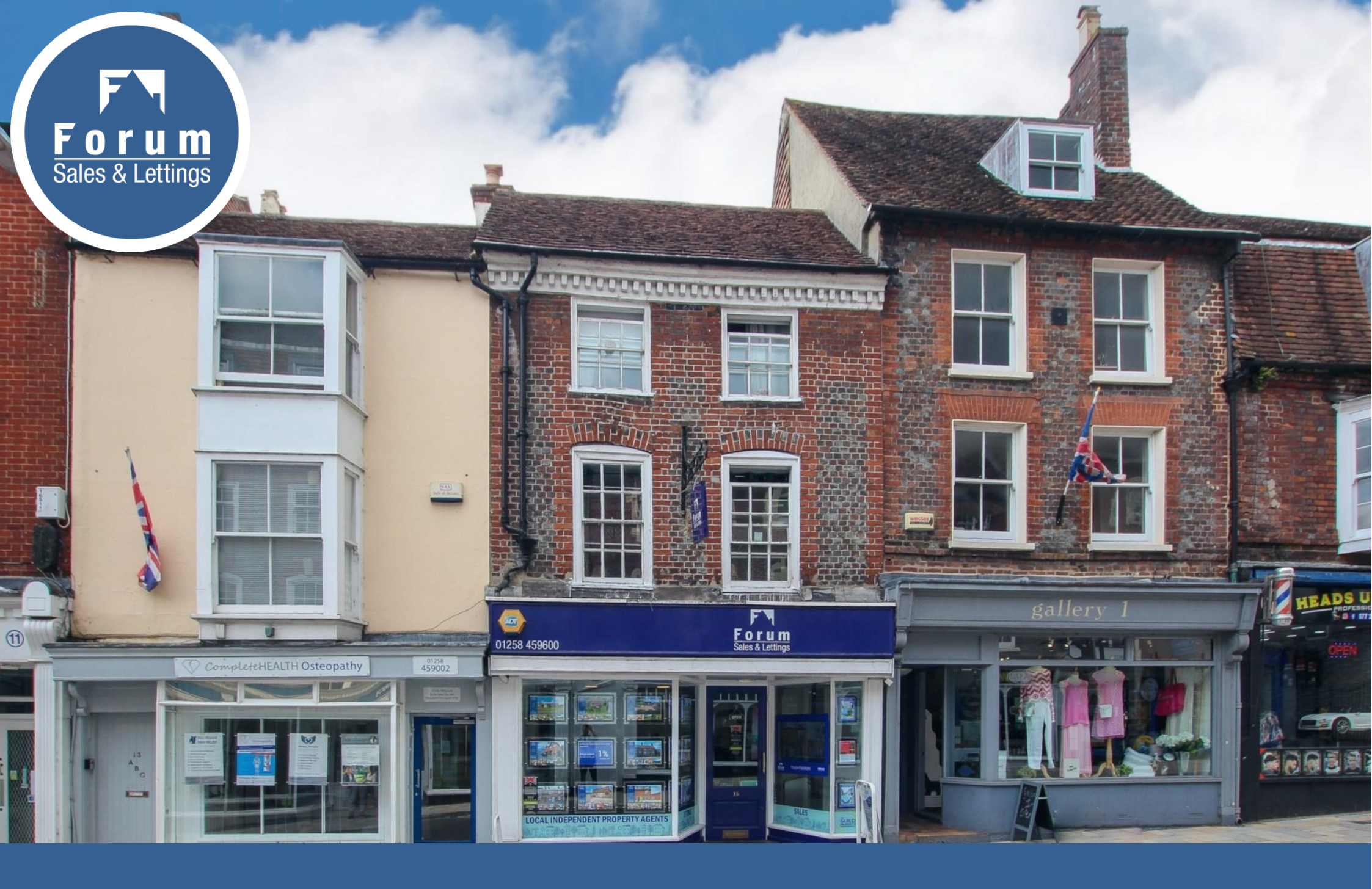
Flat, 15 Salisbury Street, Blandford Forum, Dorset, DT11 7AU