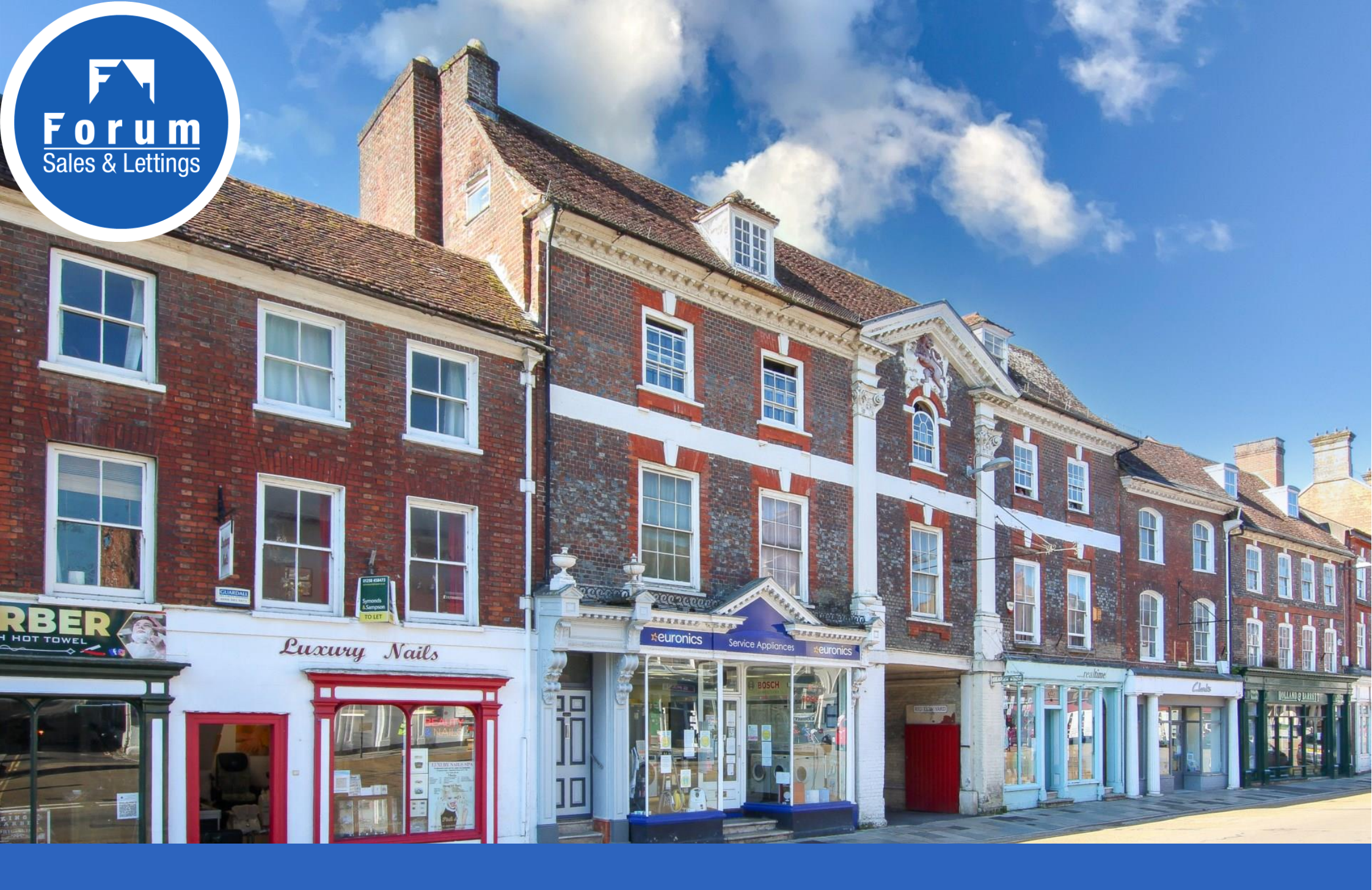
Flat 4, 20 Market Place, Blandford Forum, Dorset, DT11 7EB