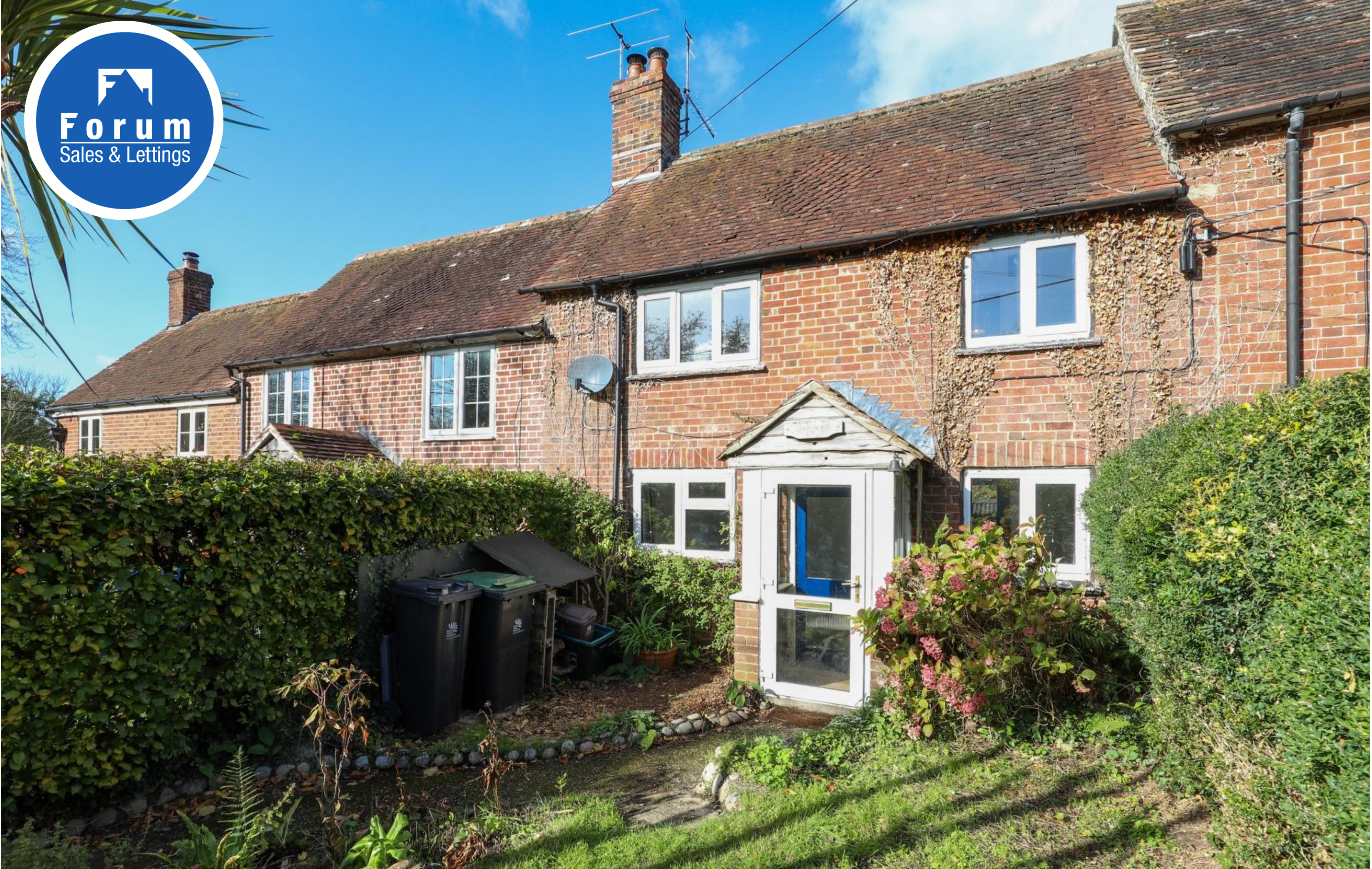
3 The Common, Child Okeford, Dorset DT11 8QY