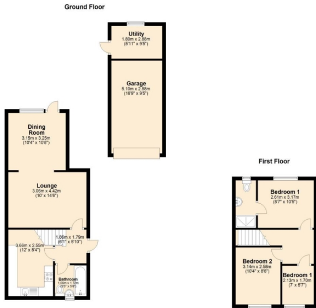
Total area: approx. 91.1 sq. metres (980.9 sq. feet)