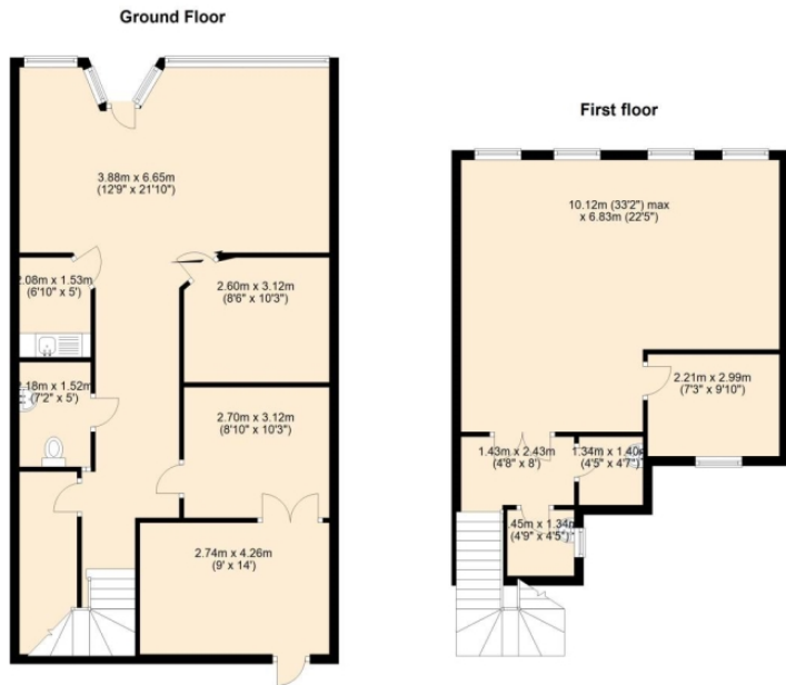
Total area: approx. 139.3 sq. metres (1499.5 sq. feet)